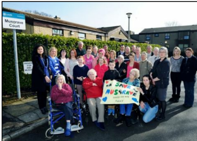
Residents & Families Protest Outside Musgrave Court, Leeds.

Please go online to sign our petition at www.gmbbyorkshire.org.uk and also make your feelings known by writing to your local councillor.