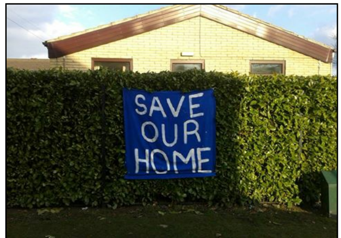
Save Our Home!!!