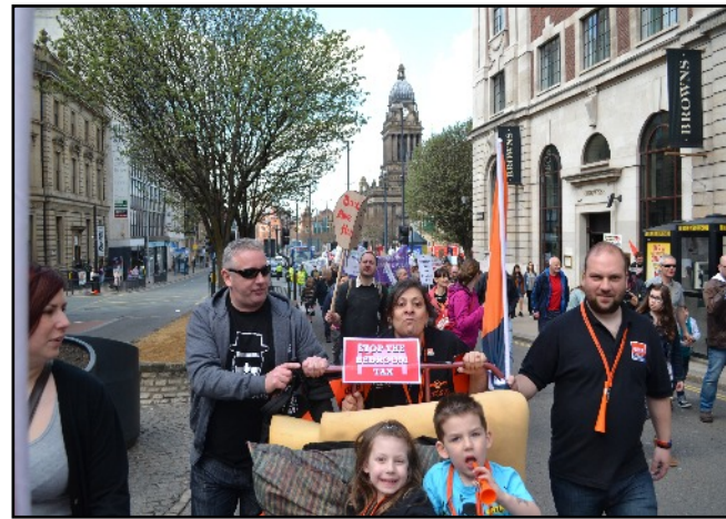
The March to Say NO!!!