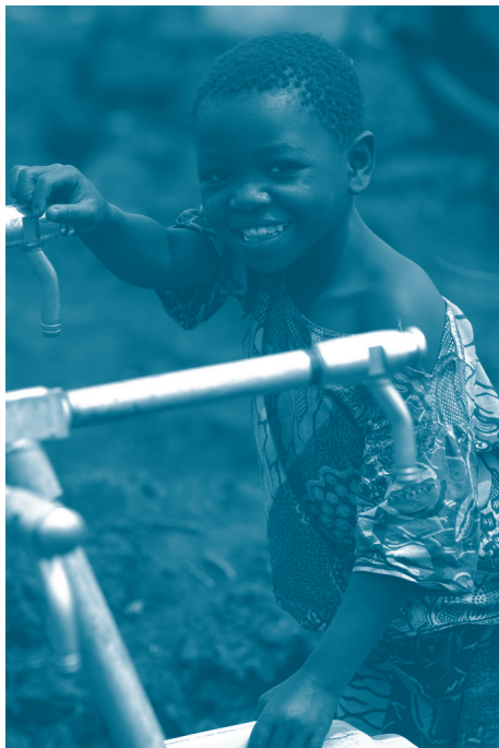
WHAT FUTURE? Young girl at the watertap in the DRC. Vulture funds take money that could be used for education and clean water.

NEWS & ACTION FROM JUBILEE USA NETWORK, WASHINGTON, DC | FALL 2009