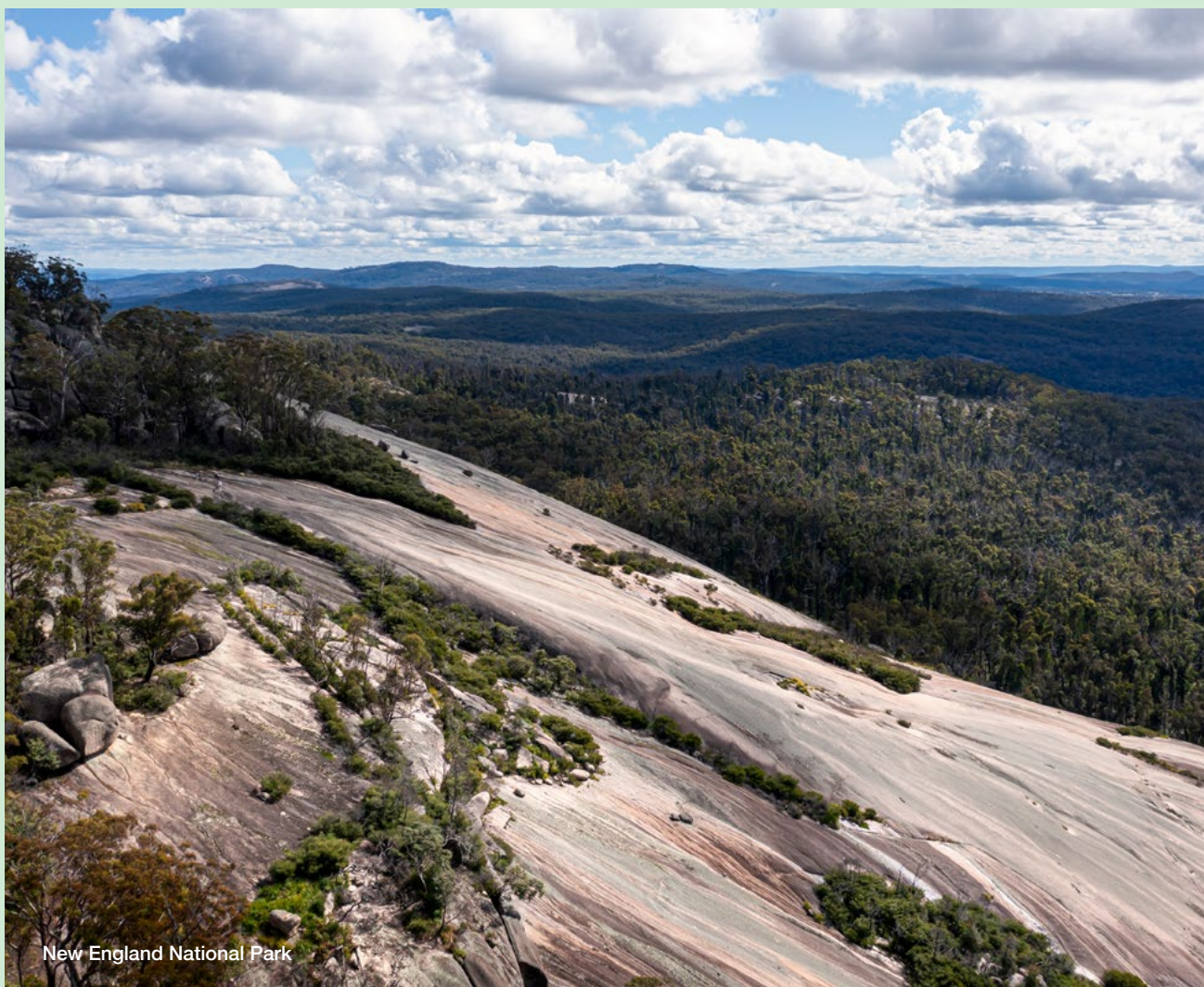
New England National Park

Brian Byrne and Bruce Stevenson ABC Friends Northern Tablelands