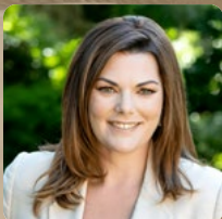
Senator Sarah Hanson-Young