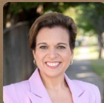
The Honourable Michelle Rowland