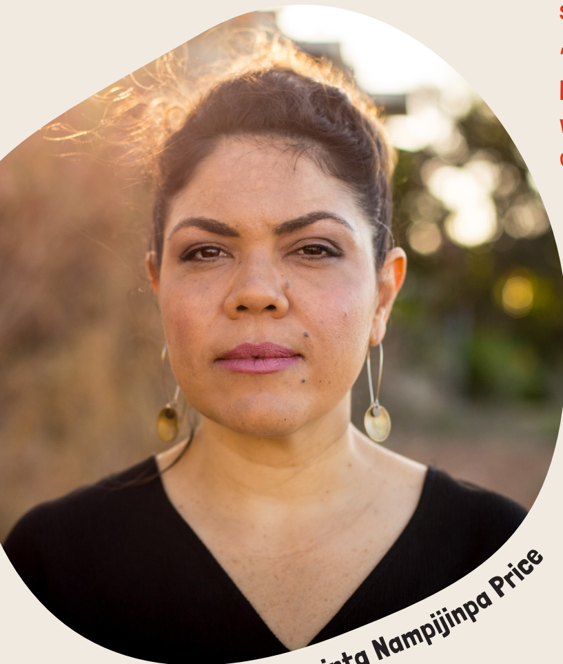
Senator Jacinta Nampijinpa Price

“They are quite safe in their homes, in their capital cities.”