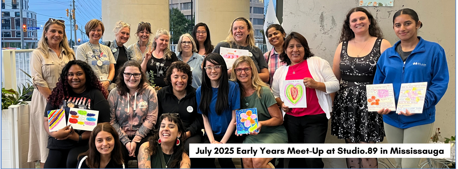
July 2025 Early Years Meet-Up at Studio.89 in Mississauga