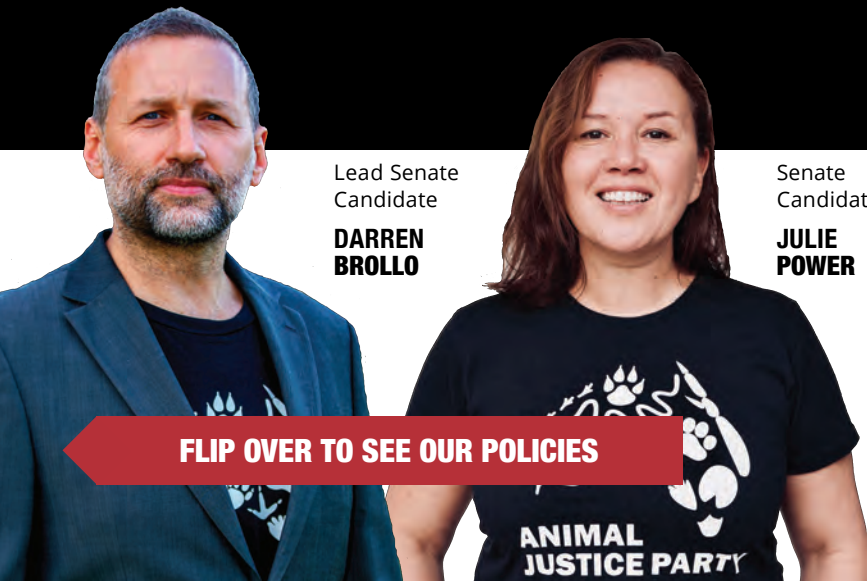
Lead Senate Candidate

Then number the boxes above the line as shown. You must number AT LEAST 6 BOXES to make your vote count.