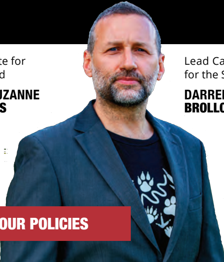
Lead Candidate for the Senate