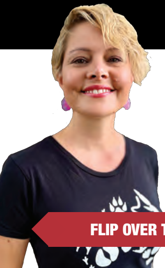
Candidate for Newcastle

Then number the boxes above the line as shown. You must number AT LEAST 6 BOXES to make your vote count.