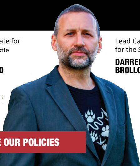
Lead Candidate for the Senate