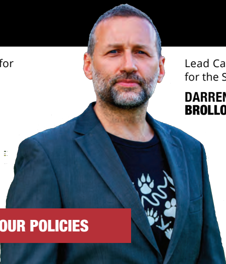
Lead Candidate for the Senate