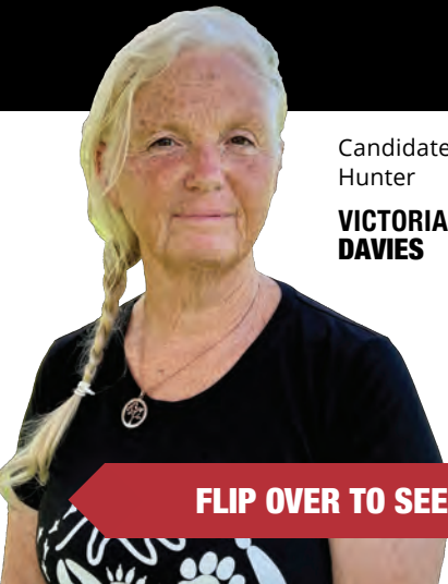
Candidate for Hunter

Then number the boxes above the line as shown. You must number AT LEAST 6 BOXES to make your vote count.