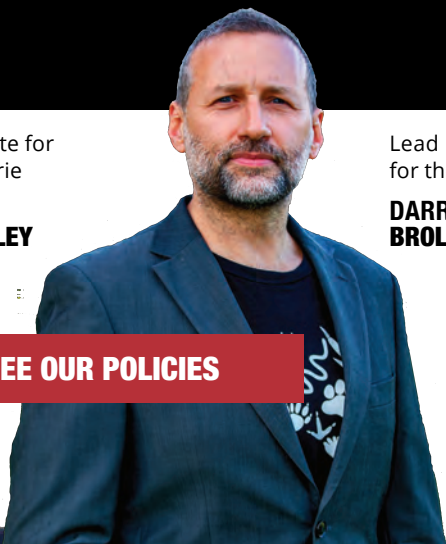
Lead Candidate for the Senate