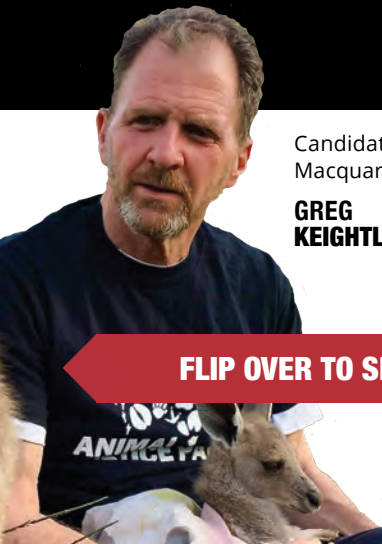
Candidate for Macquarie

Then number the boxes above the line as shown. You must number AT LEAST 6 BOXES to make your vote count.