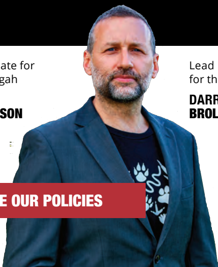
Lead Candidate for the Senate