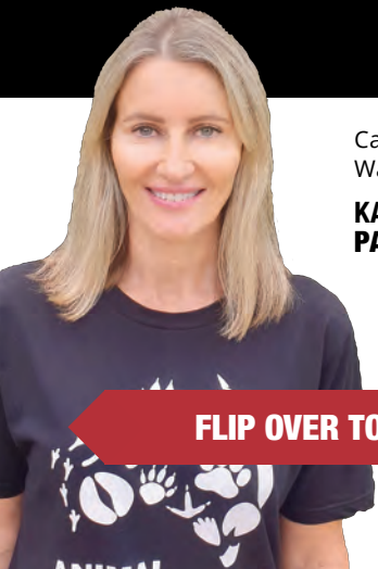
Candidate for Warringah

Then number the boxes above the line as shown. You must number AT LEAST 6 BOXES to make your vote count.