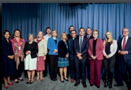
MPs united to outlaw coercive control

Prison and juvenile detention only set young people up for a lifetime of disadvantage and reoffending and disproportionately harm First Nations youth. I opposed the laws and argued that we should invest in rehabilitation, diversion programs, activities, education and employment opportunities to break the cycle of crime.