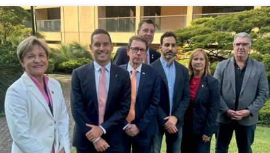
Independents and unions join forces for essential worker housing

I asked the government to better resource the Owners Corporation Network and the new Strata Commissioner to improve support for strata communities who are navigating an increasingly complex administrative framework and escalating costs. Support is especially important as the government increases housing density.