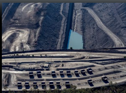
Destructive coal mines

National parks have legal plans guiding sustainable management but increasingly plans are focussing on development not conservation. I worked with the National Parks Association to get the Minister for the Environment to establish a review process to improve national park plans of management. I also called for reservation of the Murrumbidgee Flora Reserves, which support the last significant koala population on the state's south coast.