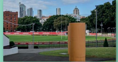
Wentworth Park needed for community use

This year I helped secure Community Building Partnership Grants for: St Canice's Church to refurbish the hall; Wayside Chapel to upgrade kitchen cooling; Bobby Goldsmith Foundation for a new vehicle; The Girls and Boys Brigade for air conditioning; Jewish House for plumbing repairs in transitional accommodation; Rushcutters Bay Kindergarten Union for a hydraulic change table; and the Millers Point Cooperative for an organic waste recycling project. These groups can now provide better facilities and services for their fantastic work.