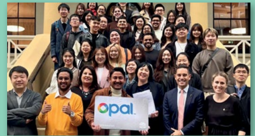
International students unite for fairer fares