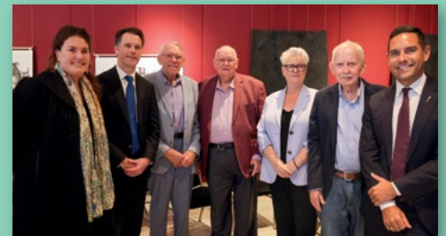
Parliament apologises for gay convictions