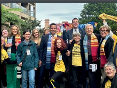
Knitting Nannas working with cross bench to protect the environment