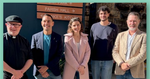
At St Canice's with Member for Wentworth, Allegra Spender