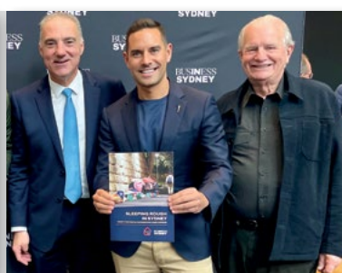
Working with Business Sydney to address homelessness