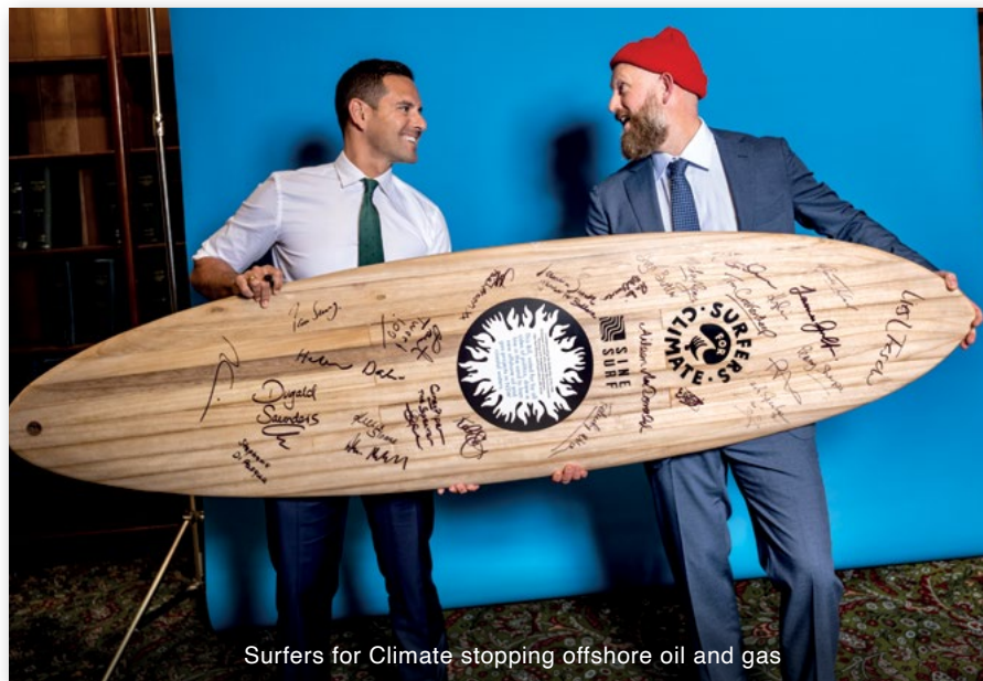
Surfers for Climate stopping offshore oil and gas