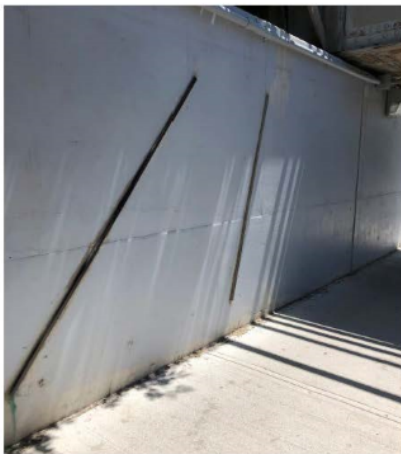
June 21, 2022

Turns out that the solar recorders under the bridge at Spadina and Dupont are all three set to work their magic not at dawn but at 12:00 noon standard time. We duly went out to check the action yesterday. And -- yes -- there is a visible alignment. The image below compares the shift in the sun's rays between the Equinox on March 21 and yesterday's solstice.