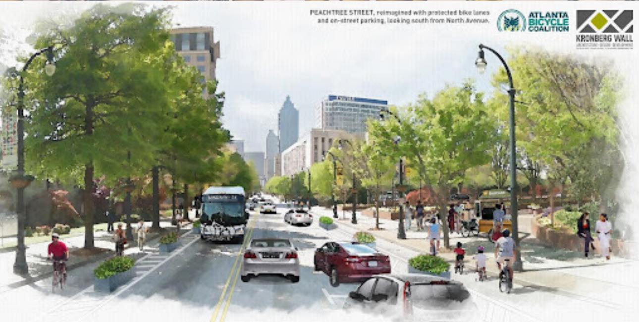
PEACHTREE STREET, reimagined with protected bike lanes and on-street parking, looking south from North Avenue.