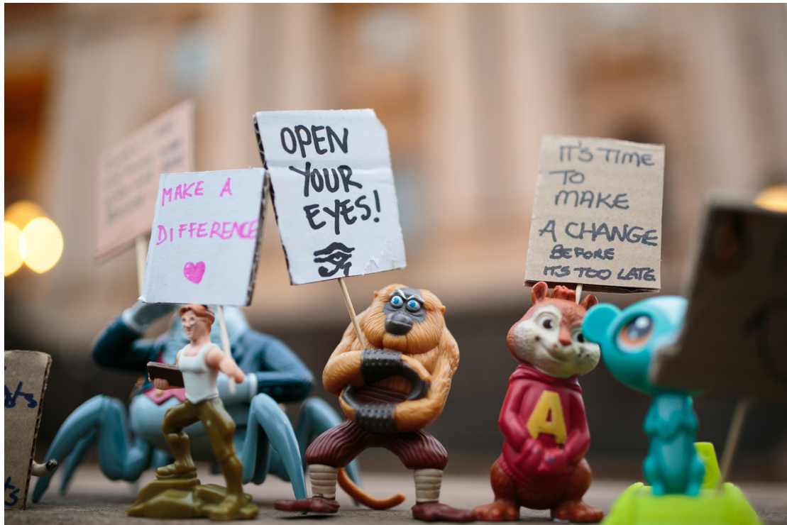
People's Climate March.