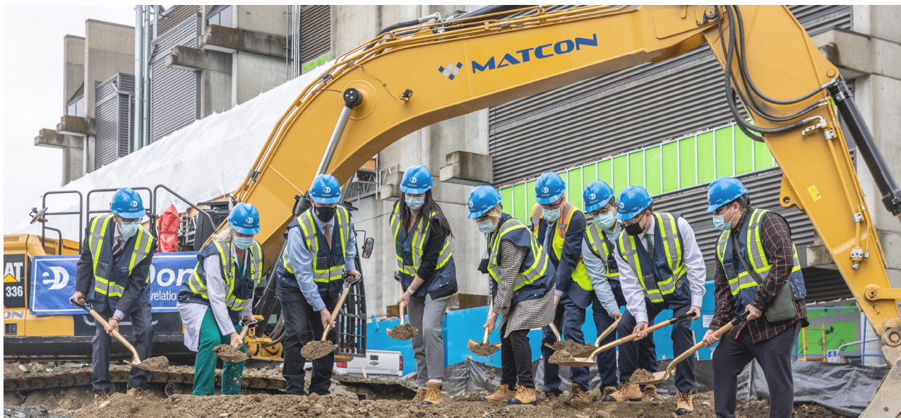
Construction begins on the Burnaby Hospital redevelopment, one of several major capital projects now facing delays under Budget 2026 .