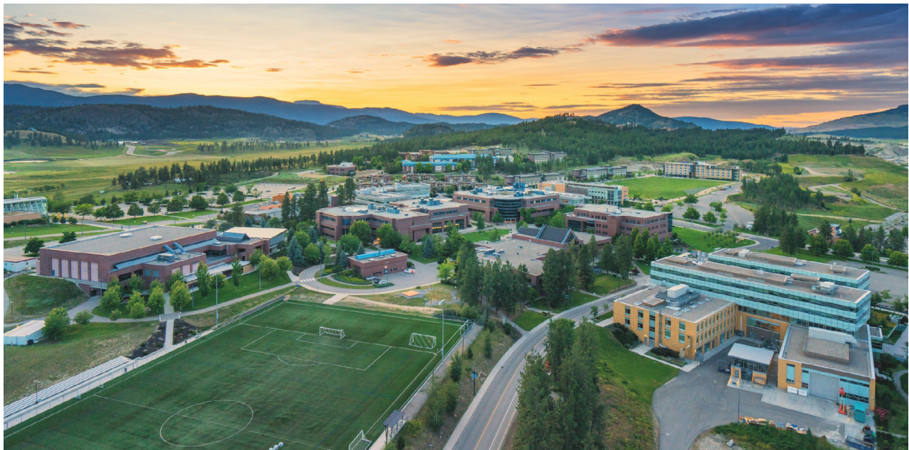
UBC Okanagan campus.

Despite historic funding increases in 2024, post-secondary institutions have struggled to adapt from the decline in tuition revenues from international studies and have increasingly turned to program cuts and general tuition increases to fund the shortfall.