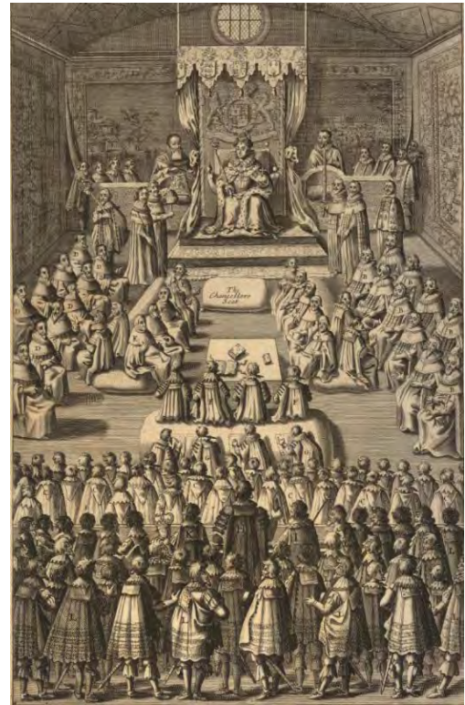
Figure 1 - Queen Elizabeth I opening Parliament. (D'Ewes)

federal, provincial, territorial and municipal governments to repudiate concepts used to justify European sovereignty over Indigenous peoples and lands, such as