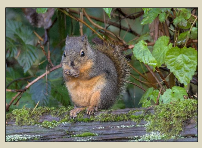
Clockwise: sandhill crane, skipper butterfly, Douglas squirrel, snowshoe hare.