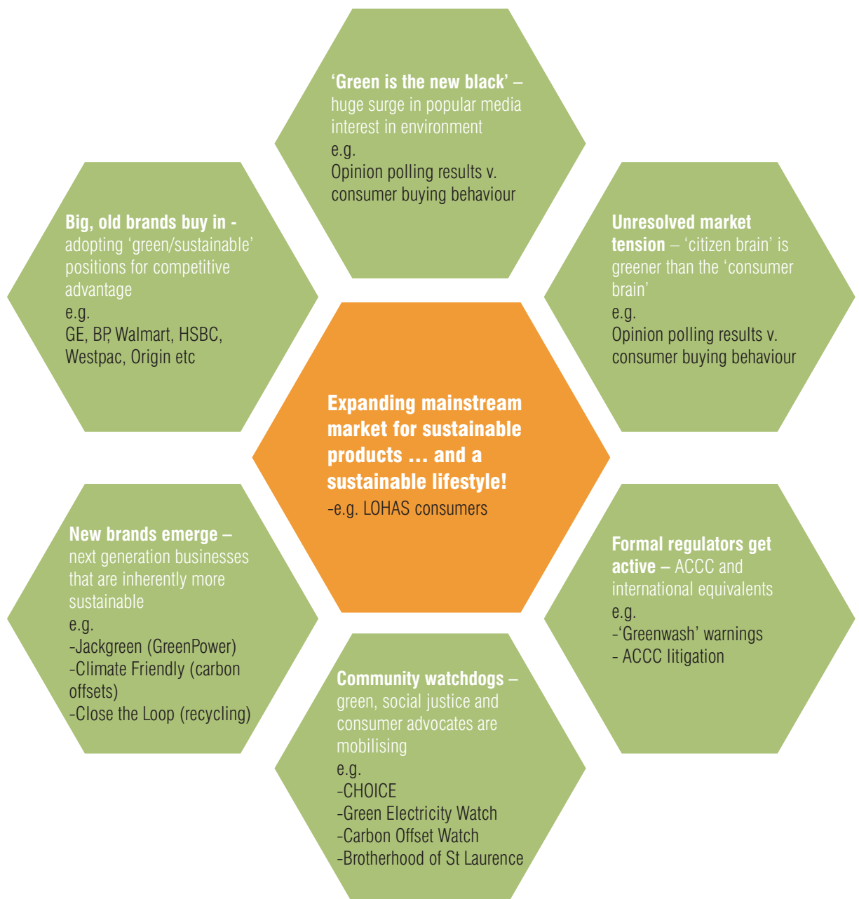
Figure 3 Emerging marcoms opportunities as sustainability shapes the market

While the official trade practices regulator the ACCC is active on targeting greenwash and bad carbon claims, this paper argues that a specific code overtly covering environmental and sustainability marketing claims should be considered, as well. This would support the public interest by protecting good green marketing from greenwash.