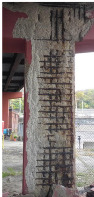
Photo 2b – Severe spalling of a pier column with exposed reinforcement reduces the load carrying capacity of the structure.