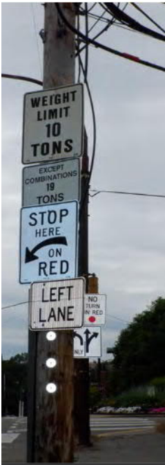
Photo 4b – The “BRIDGE” placard above the load posting signs is missing, making it unclear that the load posting signs are for the structure.