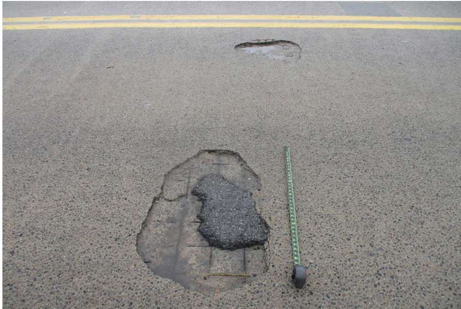
Photo 2i – Spalling in the top surface of a concrete deck with exposed reinforcement causes rough riding conditions and the potential for impaled tires which is a hazard to vehicular traffic.