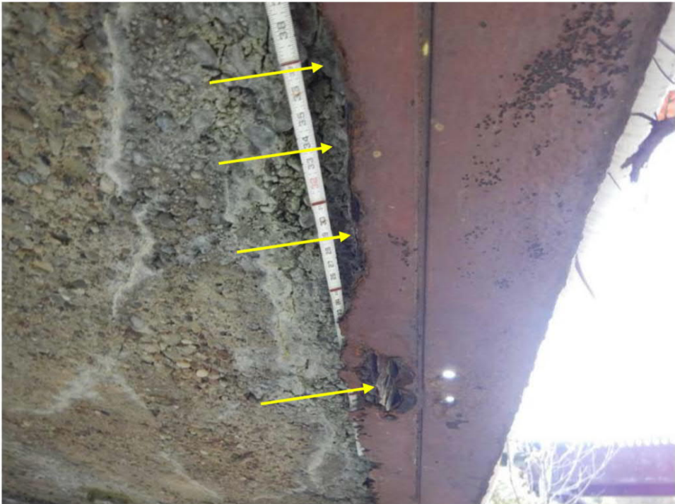
Photo 2e – Serious section loss of primary load carrying members reduces the load carrying capacity of the structure.