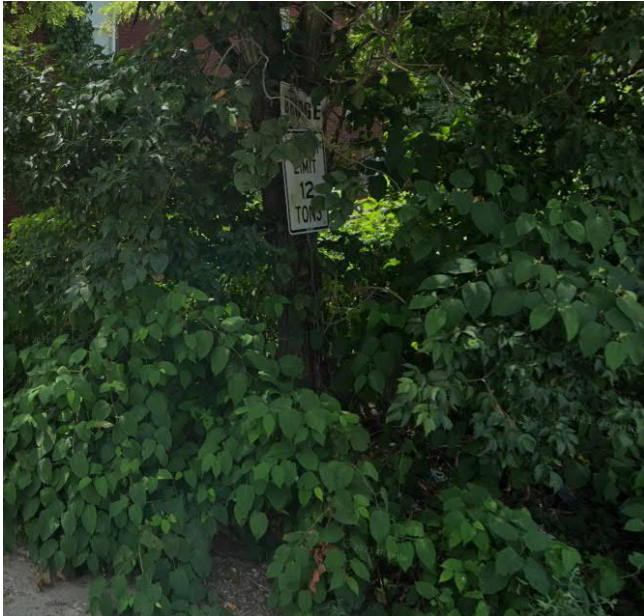
Photo 4a – Load posting sign blocked by vegetation prevents overloaded vehicles from seeing that this is the posted bridge, which could result in damage or failure of the structure when a vehicle over the posted load limit crosses the structure.