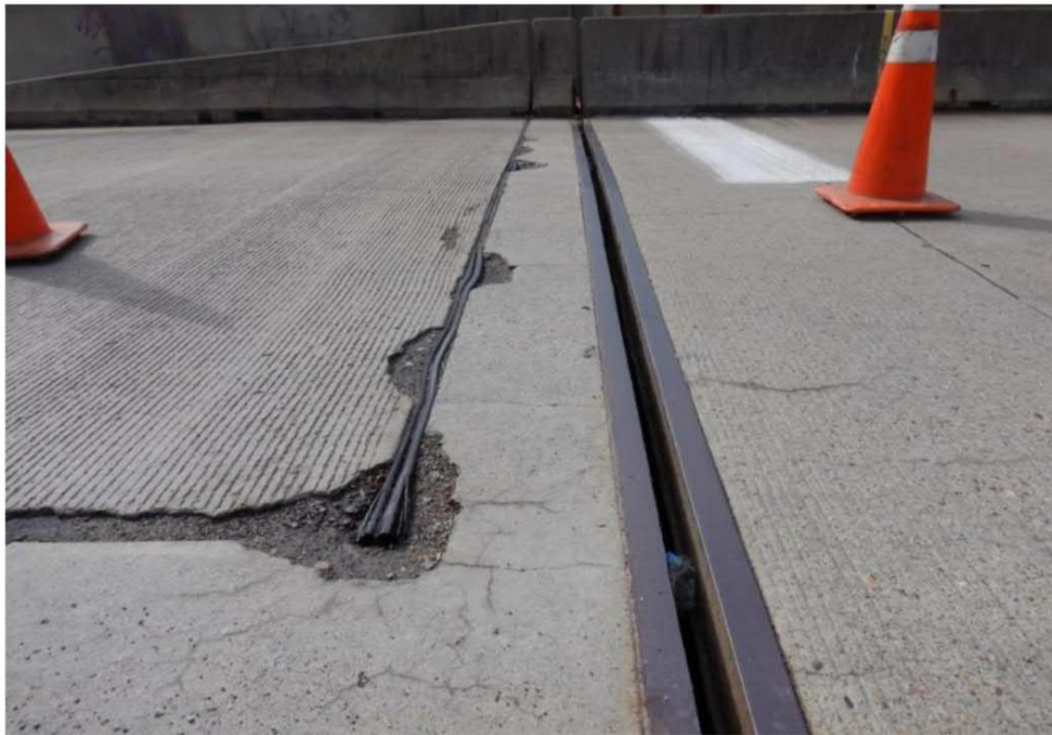
Photo 3a – Deck joint which has lost the expansion material allows water and dirt to get to the superstructure and bearings below, which causes accelerated deterioration.