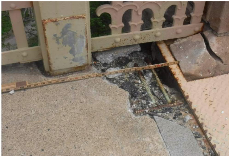
Photo 1b – A large spall on the walking surface of a sidewalk with exposed reinforcement bars poses a tripping hazard to pedestrians.