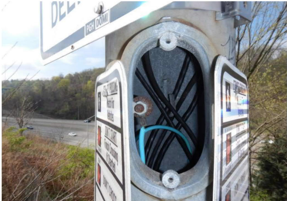
Photo 1c – A missing handhole cover on a light pole poses an electrical hazard to pedestrians.