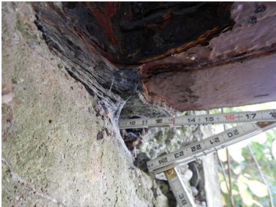
Photo 2d – Loss of bearing area of superstructure members affects the ability of loads to transfer to the substructure.