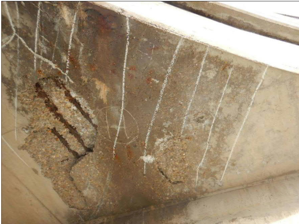
Photo 2h – Delaminated concrete above a roadway has the potential to fall onto live vehicular traffic.