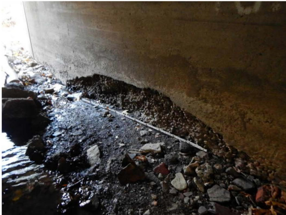
Photo 2a – Severe spalling along the bottom of a culvert barrel wall with exposed reinforcement reduces the load carrying capacity of the structure.