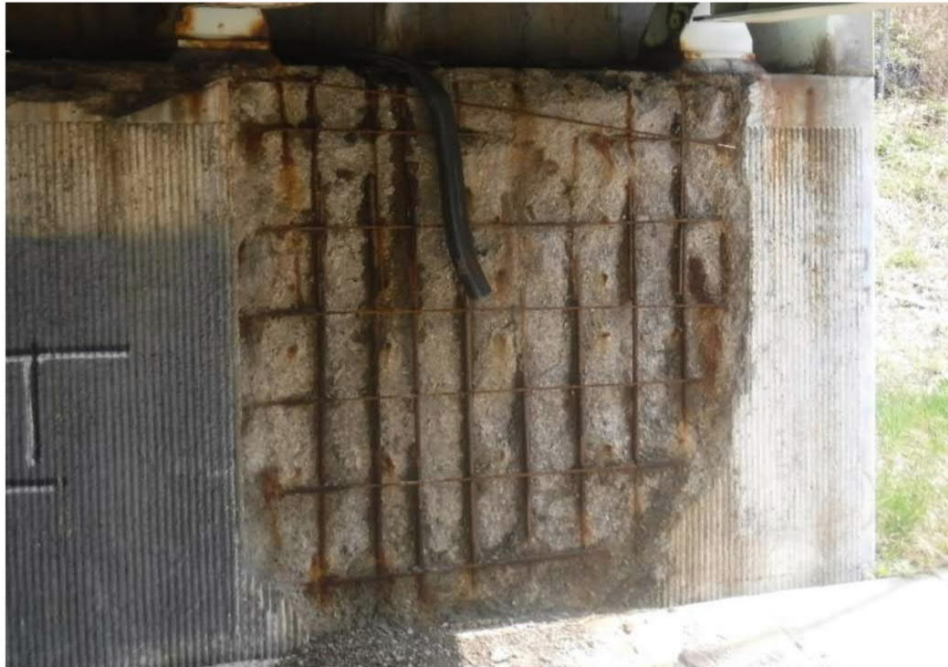
Photo 2c – Severe spalling of an abutment with exposed reinforcement reduces the load carrying capacity of the structure and causes loss of bearing support for the superstructure members.