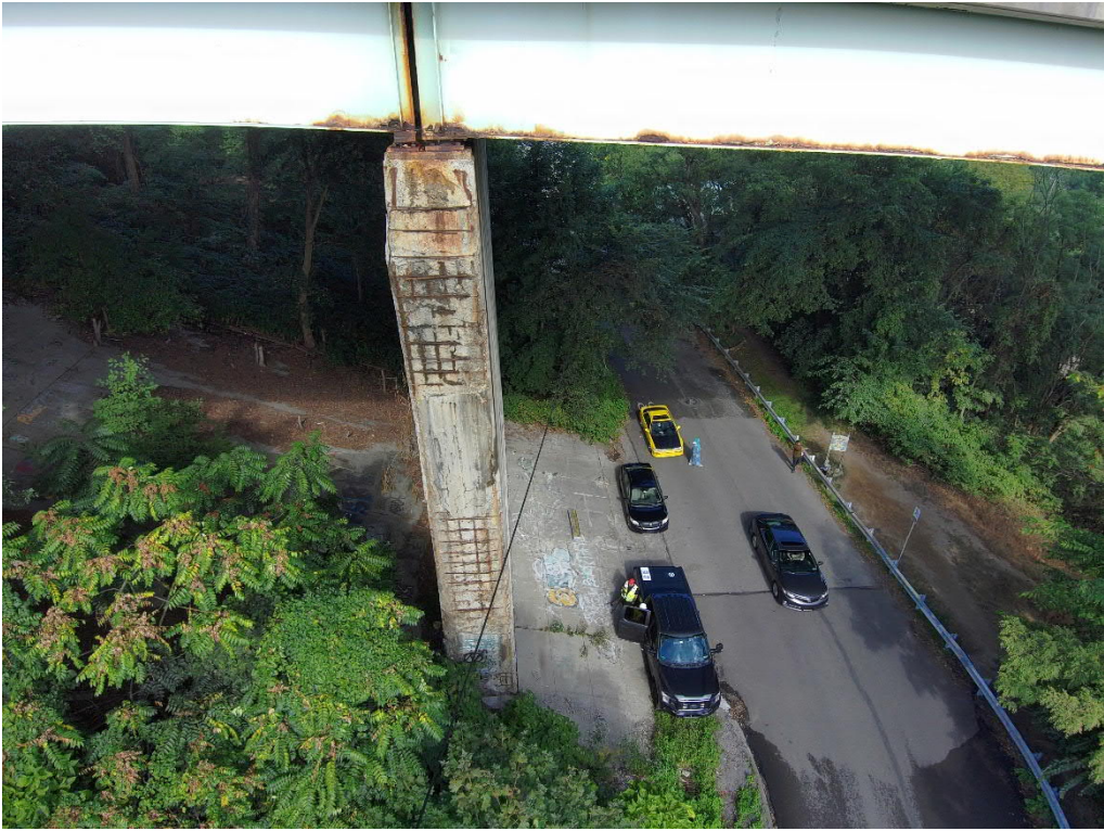
Sample Photo 2 – Bridge Pier, side view.