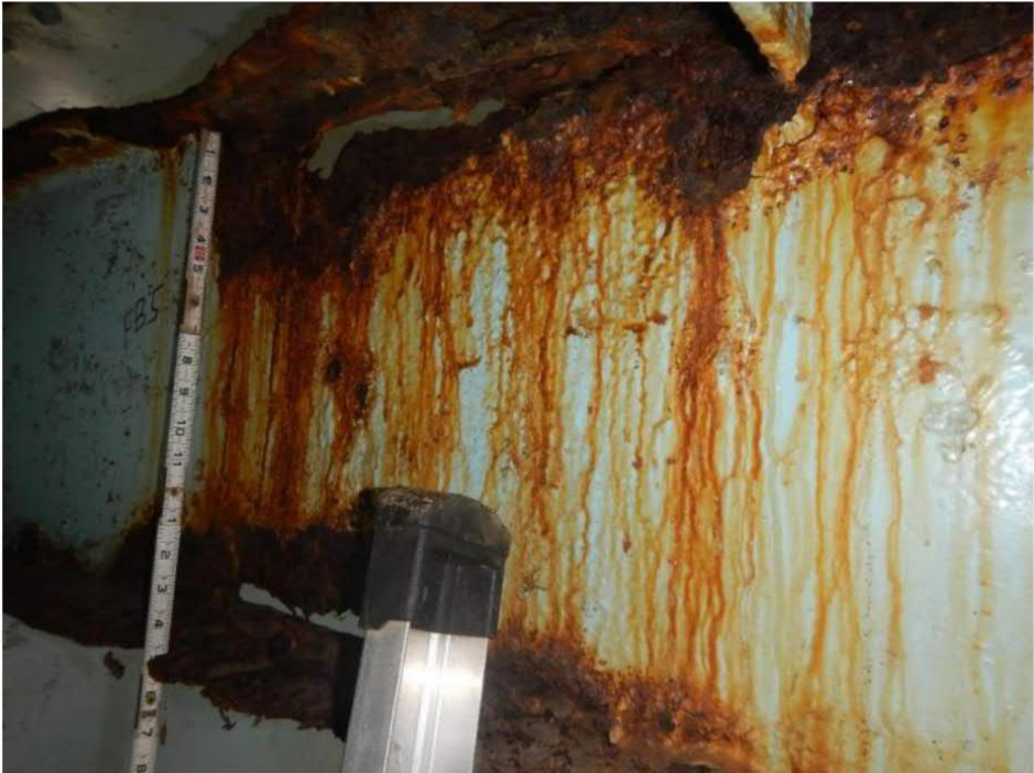
Photo 2f – Holes through a floorbeam caused by serious corrosion and section loss reduces the load carrying capacity of the structure.