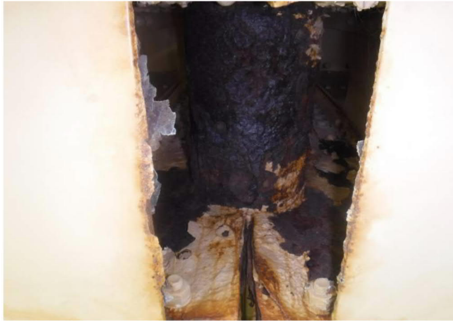
Photo 5c – Heavily corroded pin with some pitting and section loss.