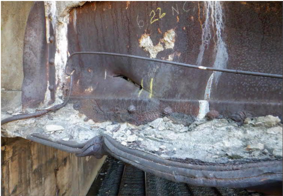
Photo 2g – Impact damage causing distortion to a primary load carrying member potentially affects the load carrying capacity of the structure.