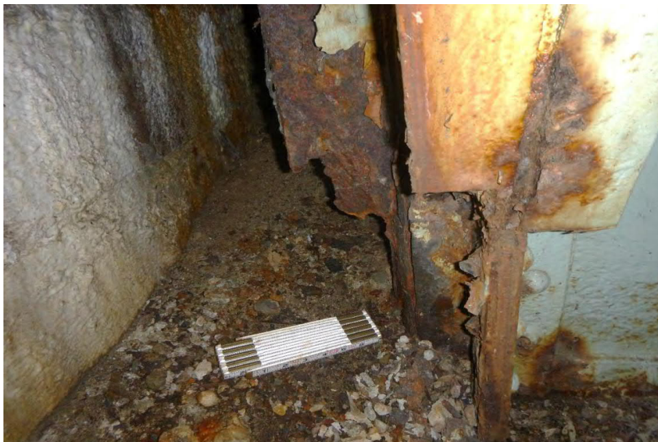
Photo 3b – A failed deck joint has caused excessive dirt buildup and moisture at the beam seat area causing accelerated corrosion and deterioration of the superstructure and bearings.