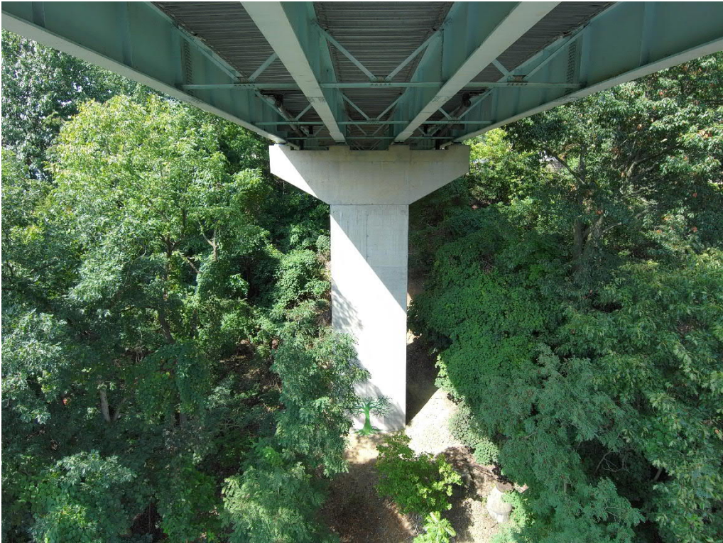
Sample Photo 1 – Bridge Pier, front view.