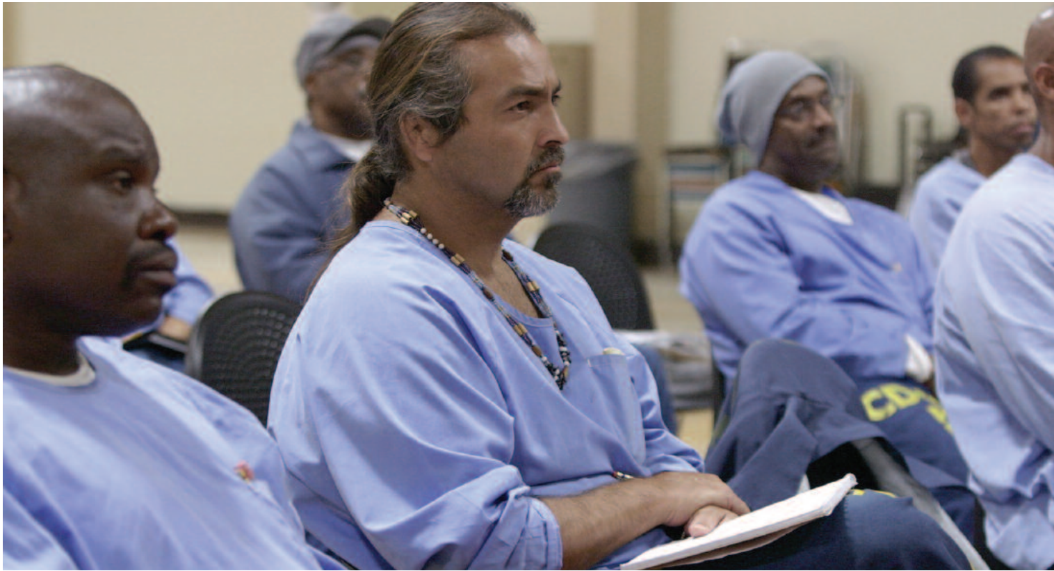
Prisoners at Soledad State Penitentiary.