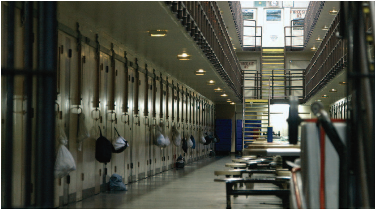
Inside Soledad State Penitentiary.