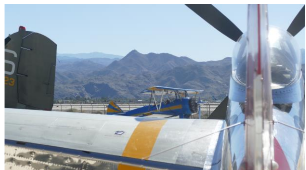
Stearman framed by the C-47 and a P-51 Mustang