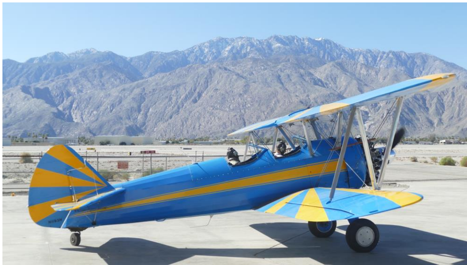
Boeing Stearman arriving after a famil flight