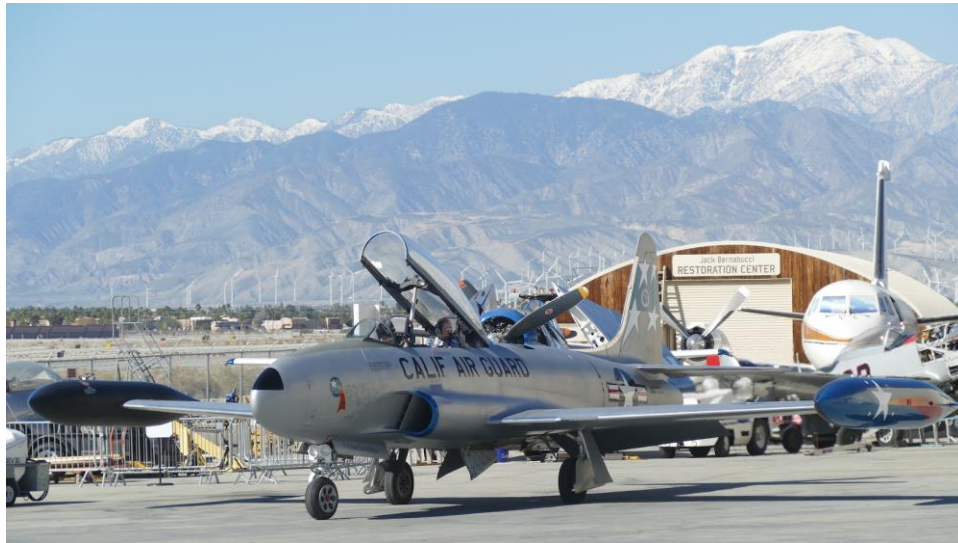
Lockheed T-33 firing up with Mt. San Geronio in the background (11,500')

While we're at the Air Museum, here are a few nostalgic shots of their ramp operations on a January Saturday. All these aircraft are used to give "rides" for costs ranging from $125 to $5,000 for half an hour.