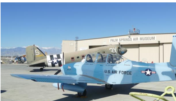
Douglas C-47 behind a Beech T-34 Mentor