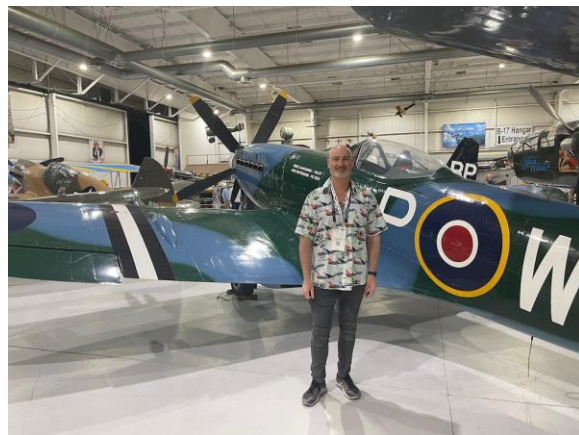
Some hero shots!