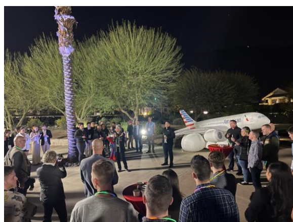
Outside the Convention Centre