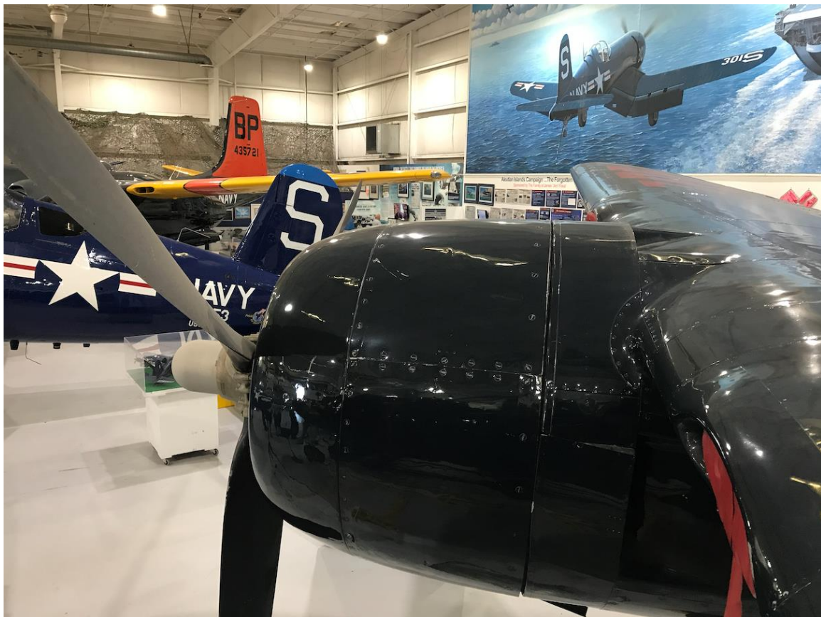
The view from the pilot's seat