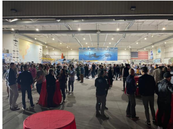
Evening reception in one of the hangars of the Palm Springs Air Museum