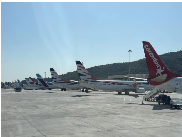
The large numbers of parked aircraft to evacuate tourists.