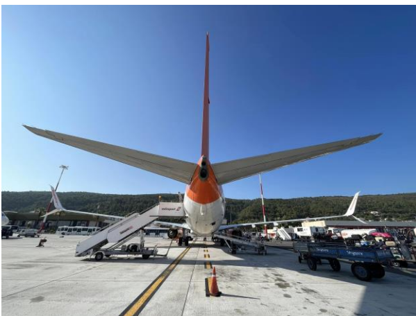
Peter’s Sunwing aircraft