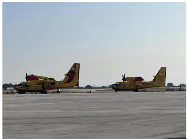
Canadian CL-215 water bombers