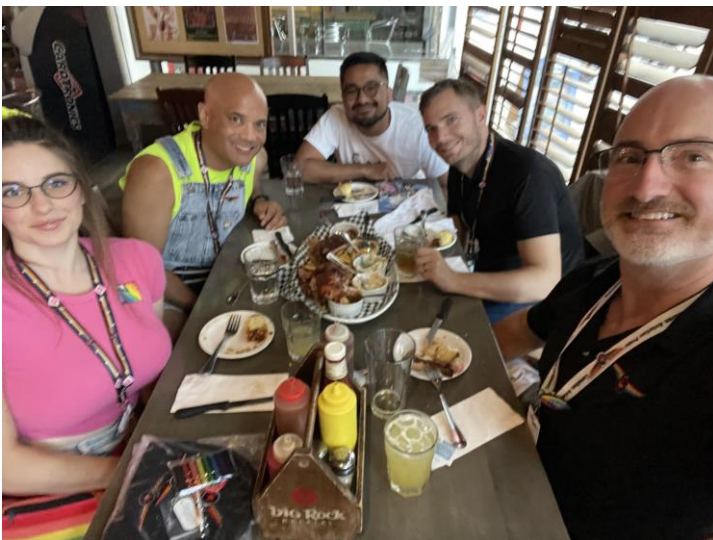
Dinner at Palomino Steakhouse