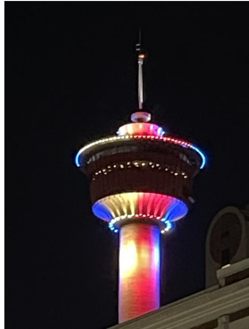
Calgary Tower lit up for Pride