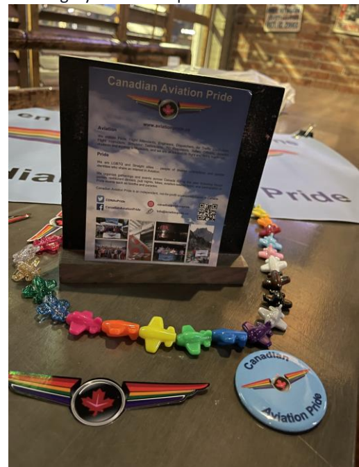
CAP 'swag' at the social