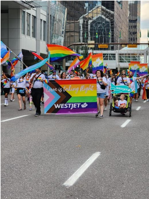
Westjet marching in the Calgary Pride parade