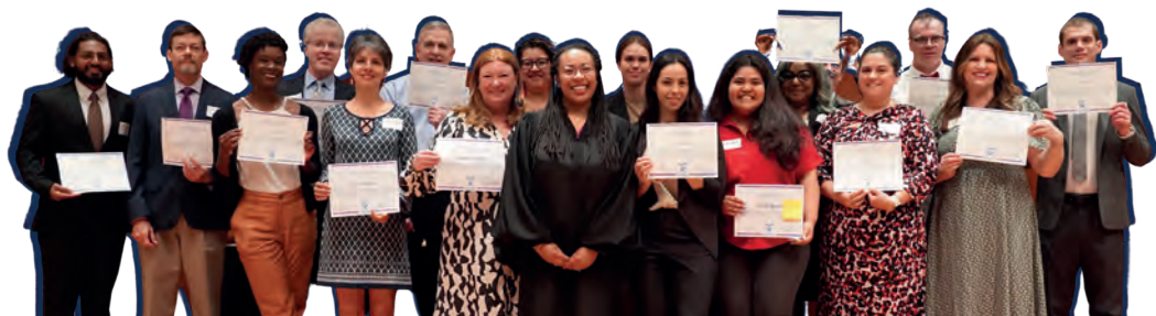
17 New CASA volunteers after being sworn in by Judge Aurora Martinez Jones (center).

When the state steps in to protect a child's safety, a judge appoints a trained volunteer advocate to make independent and informed recommendations and help the judge decide what's best for the child.