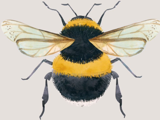
fig. a: pollinator, threatened by neonicotinoid use

Working alongside strong environmental and agricultural organizations throughout the state, Catskill Mountainkeeper effectively rallied our supporters, engaged in strategic lobbying efforts, and organized effectively to secure resounding approval for the Birds and Bees Protection Act in both the New York State Senate and Assembly . Now, with the bill awaiting Governor Hochul's signature, time is of the essence and we're doing all we can to urge her to sign it into law.