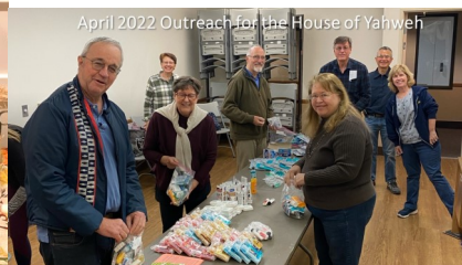
April 2022 Outreach for the House of Yahweh