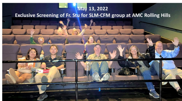
May 13, 2022 Exclusive Screening of Fr. Stu for SLM-CFM group at AMC Rolling Hills