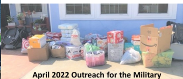
April 2022 Outreach for the Military