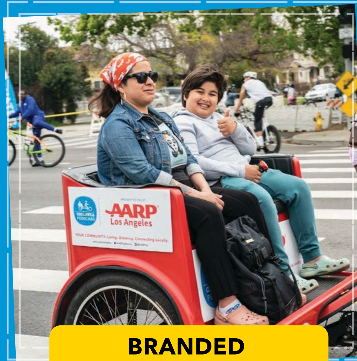
BRANDED PEDICAB FLEET