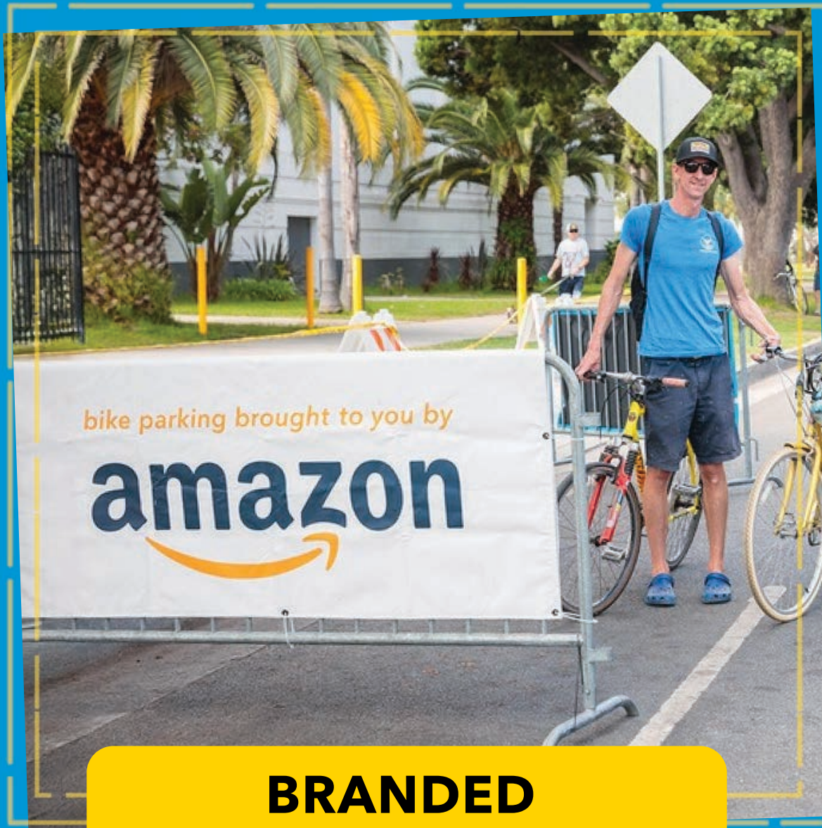
BRANDED BIKE PARKING

Linked logo on CicLAvia website event page • Social media during event day • Activation listing on website activities page