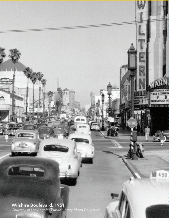
Wilshire Boulevard, 1951