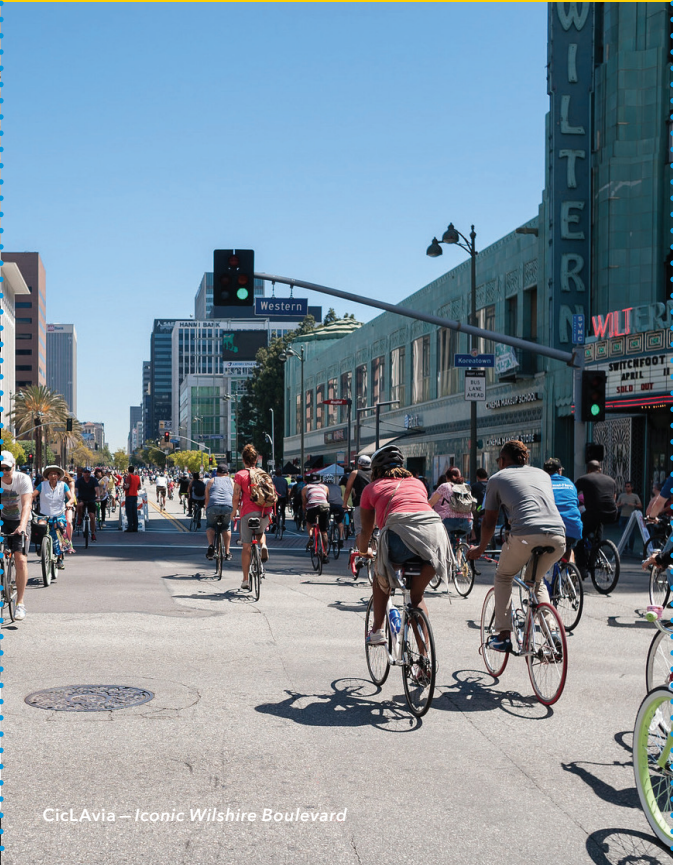
CicLAvia – Iconic Wilshire Boulevard

Post a photo of your #tomorrowLA sketch, and tag @ciclavia for a chance to win two tickets to our September 17th fundraiser!