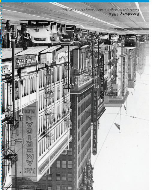
Broadway, 1954