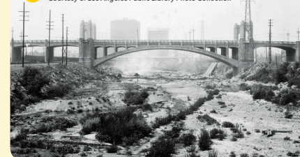
8 NEWLY CONSTRUCTED 4TH ST VIADUCT, 1931