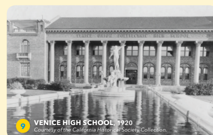
9 VENICE HIGH SCHOOL, 1920