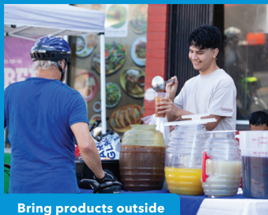
Bring products outside