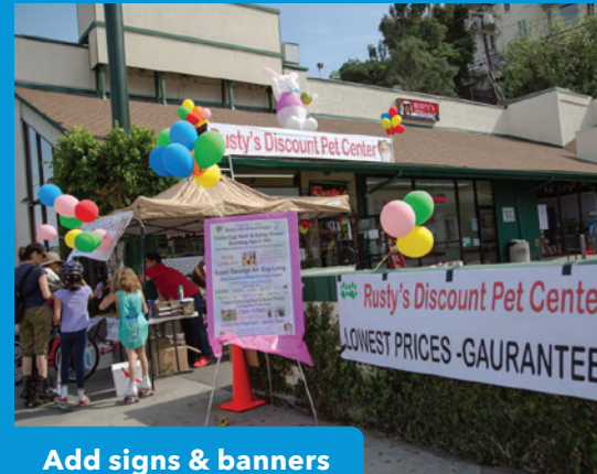
Add signs & banners