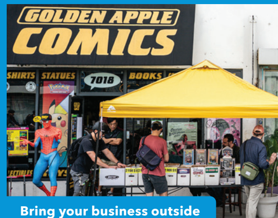
Bring your business outside