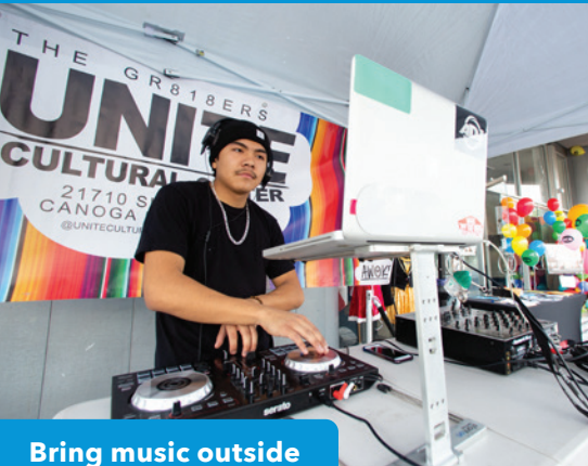
Bring music outside