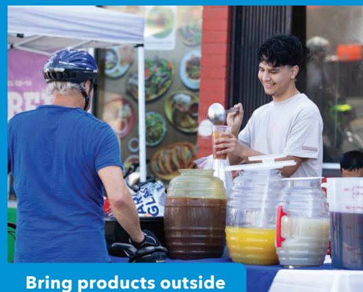
Bring products outside