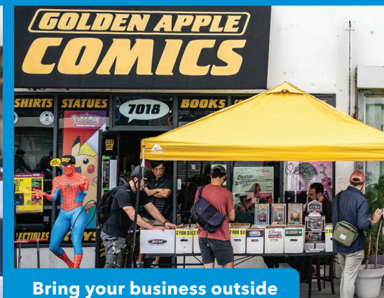
Bring your business outside