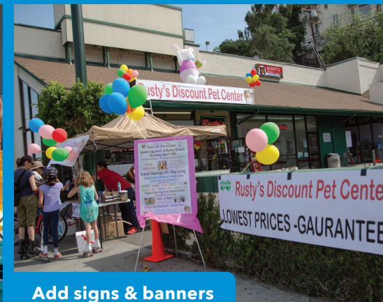
Add signs & banners