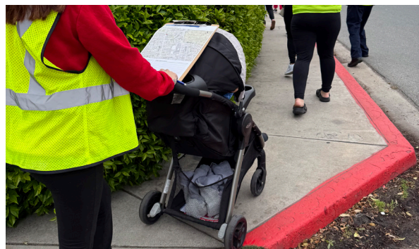
FIGURE 4. THE SIDEWALKS ON FOURTH AVENUE WERE NARROW, ESPECIALLY THIS SECTION OF SIDEWALK NEAR THE INTERSECTION WITH MOSS STREET

The audit took place shortly after the drop-off hours of Lilian J. Rice Elementary. According to the Rice Elementary community, traffic conditions during the drop-off and pick-up windows create unsafe conditions for pedestrians, cyclists, and drivers. The intersection of Fourth Avenue and L Street bottlenecks due to the large line of vehicles that forms as families drop their students off. The school community notes that drivers travel at high speeds along the L Street and Fourth Avenue corridors. The group had a close look at the intersections along these corridors such as the one on L Street and Third Avenue (see Figure 3). This intersection, and other intersections along the route were generally in adequate condition as they were equipped with pedestrian countdown signals, audible signals, and truncated domes. Some of the intersections were noted to be in need of crosswalk restriping. Families requested an increase in crossing times. The sidewalks along Fourth Avenue were noted to be narrow. This was especially an issue as the group was large and contained multiple members pushing strollers (see Figure 4). Naples Street had large segments with no sidewalk and portions of sidewalk along the route had obstructions or breaks. Families would like improvements to the sidewalk conditions which in turn would incentivize them to allow their students to walk to school.