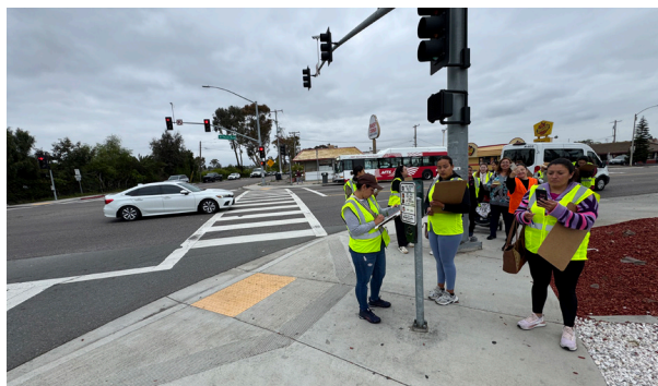
FIGURE 3. THE AUDIT GROUP EVALUATING THE INTERSECTION OF L STREET AND THIRD AVENUE WHICH WAS NOTED TO BE A DANGEROUS INTERSECTION BY THE SCHOOL COMMUNITY