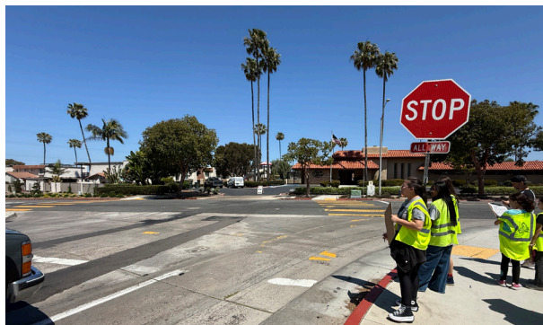
FIGURE 3: STUDENTS NAVIGATING INTERSECTION OF MT. ALIFAN DRIVE AND MT. ACADIA BOULEVARD WHERE THE CROSSWALKS NEAR THEIR SCHOOL ARE FADED.