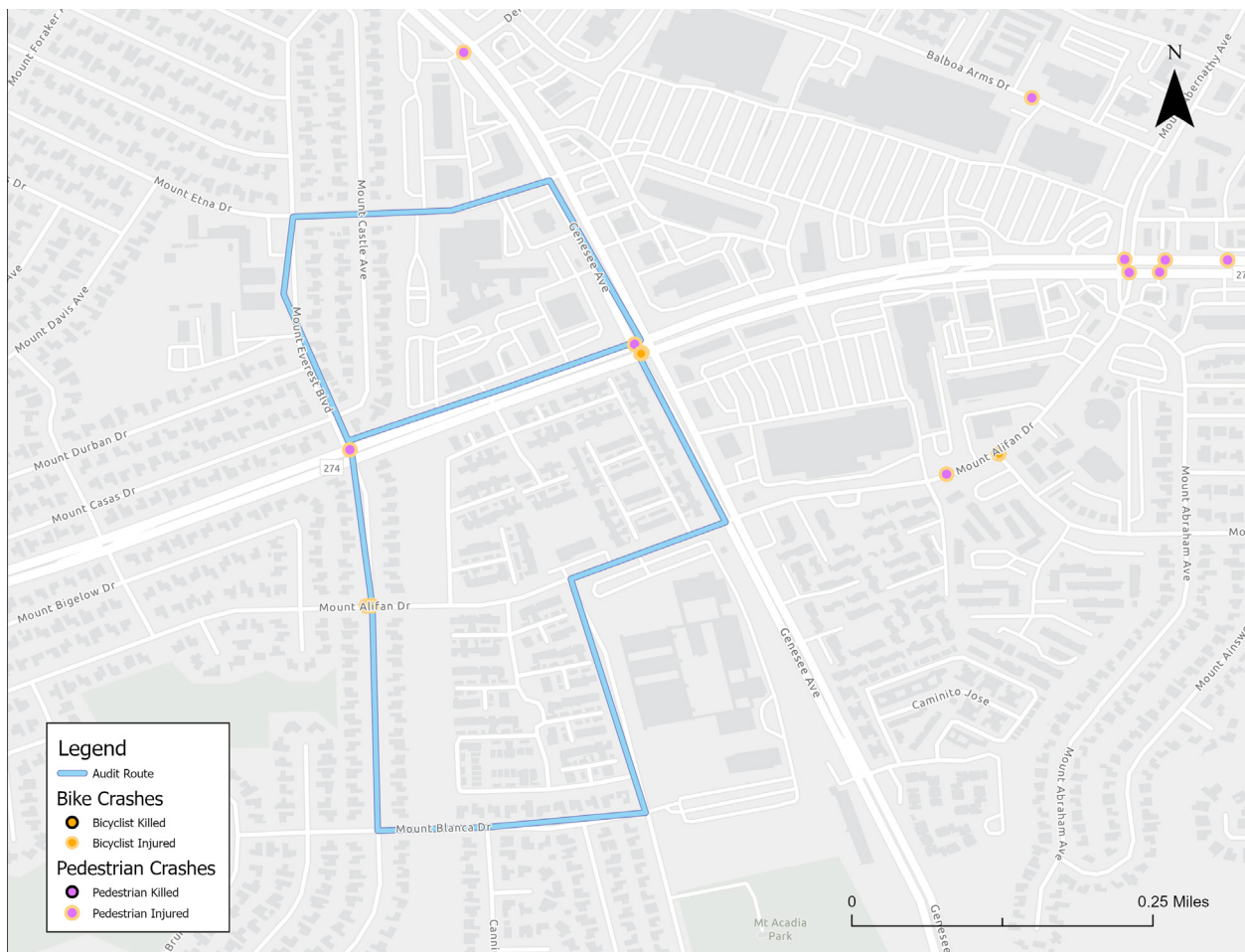
FIGURE 1. PEDESTRIAN AND BICYCLE FATALITIES AND INJURIES PROXIMATE TO BALBOA AVENUE AND GENESSEE AVENUE (2019-2023)

The field trip was attended by representatives from Circulate San Diego, Serving Seniors staff, residents of Paul Downey Senior Residence, and High Tech High Mesa students and deans. The school and senior residence are located in Clairemont, and the audit route included Balboa Avenue, Genesee Avenue, Mount Everest Boulevard, Mount Acadia Boulevard, Mount Etna Drive, Mount Castle Avenue, Mount Alifan Drive, and Mount Blanca Drive. Between 2019 and 2023, there were 10 pedestrian injuries and 3 bicyclist injuries reported within a quarter-mile radius of the route (see Figure 1). On January 1, 2022, a 77-year-old woman was severely injured after being struck by a driver while crossing the intersection of Mount Alifan Drive and Mount Everest Boulevard.