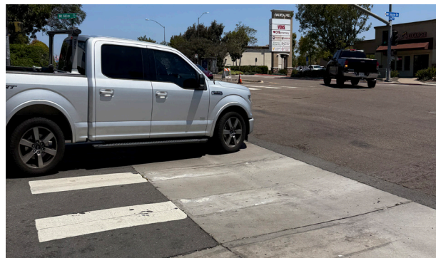
FIGURE 4: THROUGHOUT THE AUDIT, PARTICIPANTS OBSERVED DRIVER INFRACTIONS SUCH AS SPEEDING AND ENCROACHMENT INTO CROSSWALKS AND BIKE LANES.

Prior to the audit, participants expressed concerns about several intersections in Clairemont, citing inadequate pedestrian infrastructure and unsafe driver behavior. These concerns were further explored during the pedestrian audit (see Figure 2). The most significant issues were identified near High Tech High Mesa, where crosswalks were either faded or missing (see Figure 3), and around the Paul Downey Senior Residence, which lacked pedestrian-scale lighting and shade. At the intersection of Mount Etna Drive and Genesee Avenue near the senior residence, participants noted short crossing windows, missing crosswalks, no audible signals, and the absence of countdown signals—making it impossible for pedestrians to know how much time they had to cross. Although Clairemont has the potential to be a bike- and pedestrian-friendly area with many walkable destinations, unsafe driver behavior—such as speeding and failure to yield—creates serious risks for non-motorized users (see Figure 4). The audit highlights the need for improvements such as high-visibility crosswalks, longer crossing times, shade trees, lighting, refuge islands, wider sidewalks, and protected bike lanes to support a safer, more accessible community.