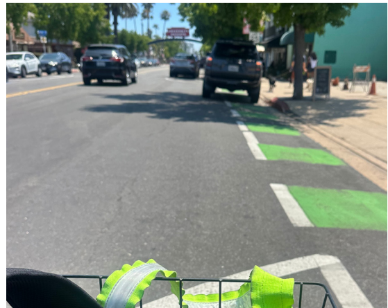
FIGURE 7. DRIVER PARKED IN THE BIKE LANE ALONG PARK BOULEVARD AND MONROE AVENUE

Funding for this program was provided by a grant from the California Office of Traffic Safety, through the National Highway Traffic Safety Administration.