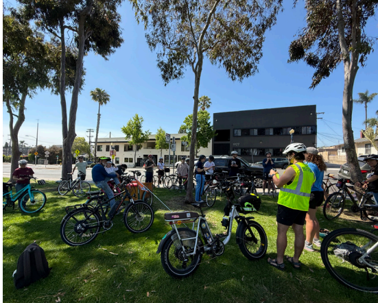
FIGURE 2. PARTICIPANTS MET AT OLD TROLLEY BARN PARK ALONG ADAMS AVENUE AND FLORIDA STREET.