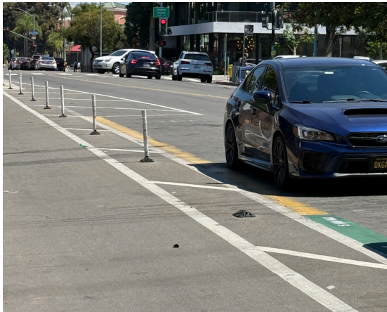
FIGURE 4. THROUGHOUT THE BIKE AUDIT, PARTICIPANTS OBSERVED BROKEN FLEXPOSTS, SUCH AS THIS ONE NEAR THE INTERSECTION OF 30TH STREET AND HOWARD AVENUE.