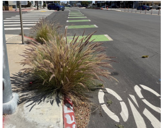
FIGURE 5. PARTICIPANTS OBSERVED OVERGROWN VEGETATION WAS OBSTRUCTING THE BIKE LANE ALONG PARK BOULEVARD