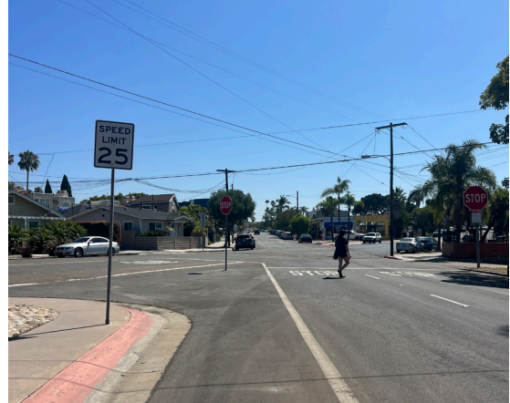
FIGURE 3. THE INTERSECTION OF FLORIDA ST, MISSION AVE, AND MADISON AVE IS IN NEED OF TRAFFIC CALMING INFRASTRUCTURE SUCH AS HIGH-VISIBILITY CROSSWALKS, CURB EXTENSIONS, STOP SIGNS, AND MODAL FILTERS.