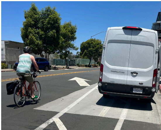
FIGURE 6. PARTICIPANTS OBSERVED NUMEROUS DRIVERS PARKED IN THE BIKE LANE, LIKE THIS AMAZON DELIVERY DRIVER BY PARK BOULEVARD AND EL CAJON BOULEVARD