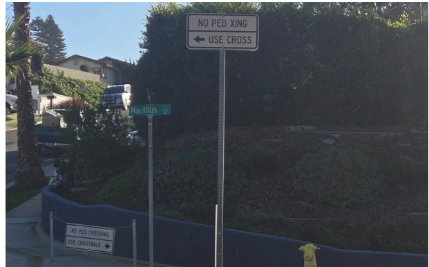
FIGURE 4: INTERSECTIONS WITH NO MARKED CROSSWALKS AND SIGNS DIRECTING PEDESTRIANS TO FURTHER INTERSECTIONS.