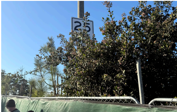
FIGURE 3: PLANT OVERGROWTH BLOCKING THE 25 MPH SIGN FOR DRIVERS TRAVELING WEST ON NAUTILUS STREET.