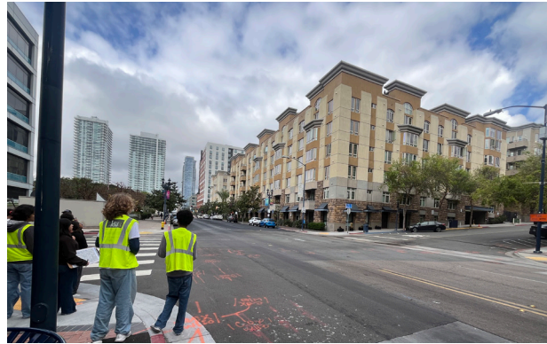
FIGURE 3: INTERSECTION OF 15TH STREET AND BROADWAY IS MISSING CROSSWALKS, AND PARTICIPANTS OBSERVED A DRIVER FAILING TO YIELD AT THE ONLY MARKED CROSSWALK