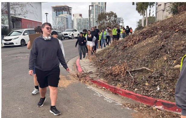
FIGURE 4: CURB RAMP WAS COVERED WITH TREE BRANCHES ON RUSS BOULEVARD. PARTICIPANTS CAN BE SEEN WALKING ON A NARROW SIDEWALK AND AROUND THE PLANT DEBRIS.

Throughout the audit, the group noted that some sidewalks were blocked due to ongoing construction, and that many intersections lacked audible push buttons, curb ramps, or accessibility for pedestrians with mobility challenges (Figure 2). However, for most of the audit, the group observed shade along the sidewalks and pedestrian scale lighting, especially on 16th Street. On Broadway, participants noted that the intersection at 15th Street is missing three crosswalks, and a driver failed to yield to participants crossing the street (Figure 3). Participants also observed differences between the bus stops on the north and south sides of Broadway and 15th Street. The north side serves the westbound bus stop and includes a bus shelter and seating, while the south side bus stop does not provide these amenities. While traveling back on Park Boulevard, participants had to cross the street because the sidewalk was blocked across from City College Station, and observed two more driver infractions in which drivers failed to yield to pedestrians at Park and B Street and Park and Russ Boulevard. Lastly, by San Diego High School, the group observed narrow sidewalks and plant overgrowth blocking the curb ramp on Russ Boulevard (Figure 4). To address these pedestrian conflicts, the group discussed potential improvements such as audible push buttons, restriping faded crosswalks, and installing two curb ramps per corner to help people with mobility challenges.