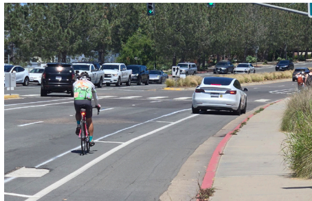
FIGURE 4: DRIVER WAS OBSERVED ENCROACHING OVER THE BICYCLE LANE, AND THE CYCLIST MERGED ON TO THE TRAVEL LANE. THE POSTED SPEED LIMIT IS 45 MILES PER HOUR.