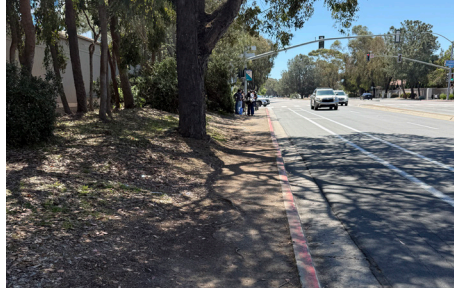
FIGURE 3: AN UNEVEN SIDEWALK, A LACK OF LIGHTING, AND THE 101 BUS STOP LACKING AMENITIES BY EXPLORATION DRIVE AND NORTH TORREY PINES ROAD.