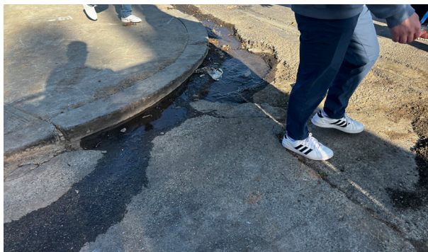
FIGURE 3: NO PAINTED CROSSWALK AND FLOODED POT-HOLE CREATES UNSAFE WALKING CONDITIONS