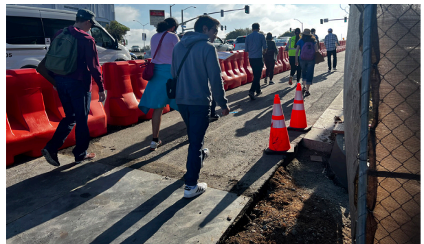
FIGURE 4: GROUP PARTICIPATING ON TRIP; TEMPORARY SIDEWALK AMIDST THE CONSTRUCTION

The walking field trip took place along El Cajon Boulevard, primarily between Park Boulevard and Idaho Street (see Figure 2). While four intersections on El Cajon Boulevard had a complete set of crosswalks, any intersection lacking north/south pedestrian access did not provide an east/west crosswalk. Participants observed obstacles that made it difficult for pedestrians to walk, including missing curb ramps, steep inclines, flooding, and trash. As displayed in Figure 3, there is flooding and a pothole on the corner of Howard Avenue and Idaho Street, which makes it dangerous for crossing pedestrians and turning vehicles. Participants also noted broken or narrow sidewalks on many streets. Towards the end of the walk, there was construction on Park and El Cajon Boulevard, but barriers were put in place to create an alternative sidewalk for pedestrians (see Figure 4). Participants mentioned the walk was pleasant at times due to shading from trees, bicycle and scooter parking, local business frontages, and company from other participants, but they would like to see improved sidewalk conditions, public trash cans, and bus shelters to make it a completely leisurely walk.