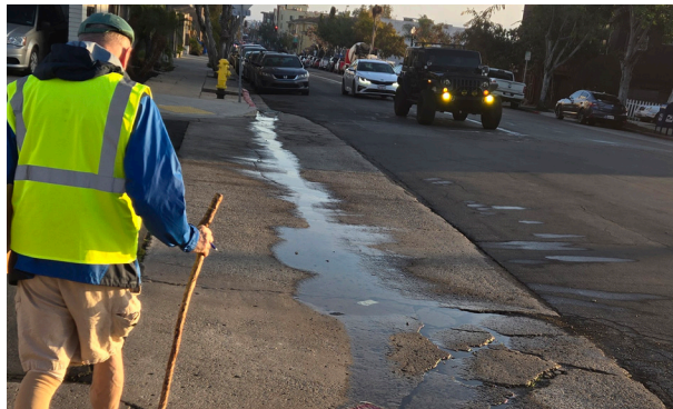
FIGURE 5: PARTICIPANTS ENCOUNTERED FLOODING IN THE CROSSWALKS AND BIKE LANES THROUGHOUT THE AUDIT.