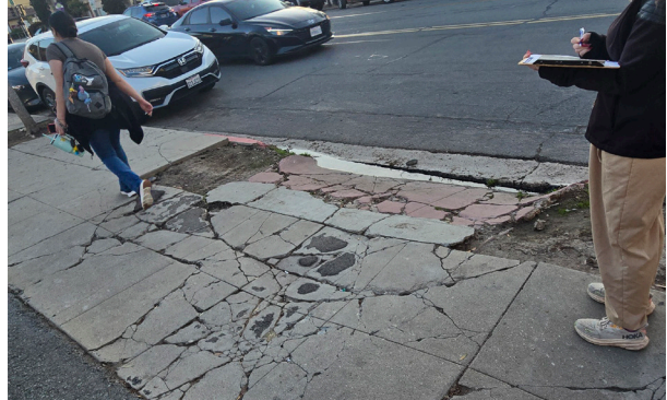
FIGURE 4: THERE WERE NUMEROUS BROKEN SIDEWALKS AND HOLES ALONG 30TH STREET, MAKING IT DIFFICULT TO NAVIGATE, ESPECIALLY FOR THOSE USING MOBILITY AIDS OR STROLLERS.