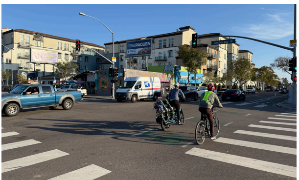
FIGURE 10: 30TH STREET IS A BUSY, SHARED SPACE, AND EVERYONE WHO USES IT DESERVES TO FEEL SAFE.