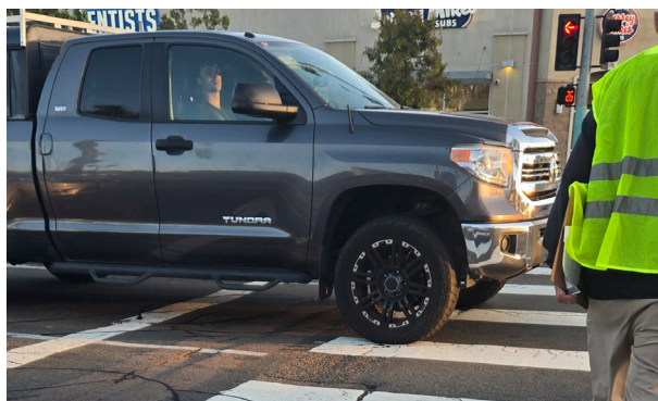
FIGURE 9: DRIVER ENCROACHING ON THE CROSSWALK IN FRONT OF PARTICIPANTS ON EL CAJON BOULEVARD.