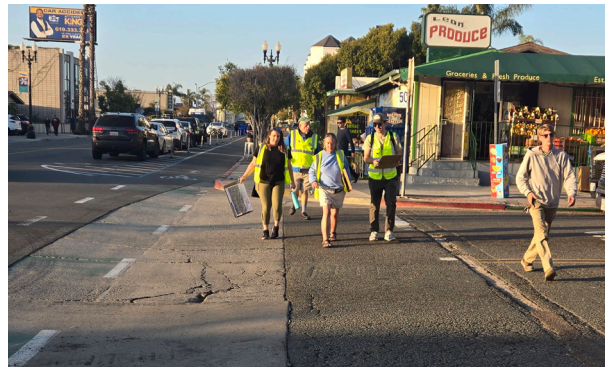
FIGURE 7: PARTICIPANTS CROSSED THE BUSY MADISON AVENUE AND 30TH STREET INTERSECTION WITHOUT A CROSSWALK.