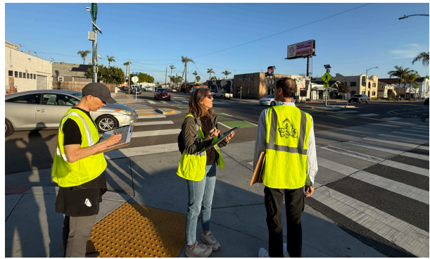
FIGURE 6: AT 30TH STREET AND LANDIS STREET, THE GROUP ENCOUNTERED AN INTERSECTION WITH INFRASTRUCTURE FOR ALL ROAD USERS.