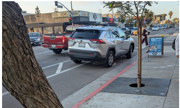
FIGURE 8: DRIVER USES BIKE LANE TO MAKE A RIGHT TURN ONTO LINCOLN AVENUE.