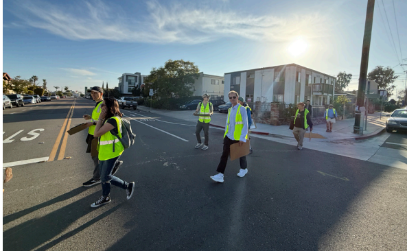
FIGURE 3: PARTICIPANTS CROSSED THE STREET AT POLK AVENUE AND KANSAS STREET, WHERE THERE IS NO CROSSWALK.