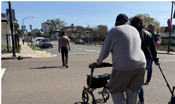
FIGURE 3: PARTICIPANTS NOTED MANY INTERSECTIONS ON ISLAND AVENUE WITHOUT CROSSWALKS AND CURB EXTENSIONS WHILE CROSSING.