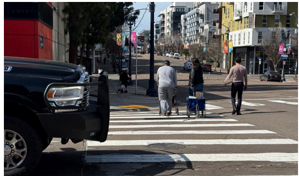
FIGURE 4: PARTICIPANTS OBSERVED DRIVERS FAILING TO YIELD AS THEY CROSSED THE INTERSECTION OF 16TH STREET AND MARKET STREET.

Circulate and the participants assessed the pedestrian conditions between the Potiker Senior Residence building and Interstate 5 (see Figure 2). Between 15th and 17th Streets on Island Avenue, participants noted the absence of traffic calming measures, such as curb extensions and crosswalks, which made it challenging for participants using mobility aids to feel visible. Serving Seniors staff assisted by stopping traffic to help the older adults cross the street safely (see Figure 3). As the group approached Market Street, participants noticed broken sidewalks and the absence of crosswalks on both 15th and 17th Street. At these intersections, diverters are also in place to prevent drivers from going straight or making left turns; however, participants observed that the diverters were broken. At the intersection of 16th Street and Market Street, the group observed drivers encroaching on the crosswalk, despite the short crossing window (see Figure 4). Nonetheless, participants appreciated the wide sidewalks around their residence building. This pedestrian audit reinforced the need for high-visibility crosswalks, curb extensions, and median islands to ensure individuals of all ages and abilities can travel safely on our streets. Installing a hardened median at the intersections of 15th, 17th, and Market Streets would assist in preventing driver infractions.