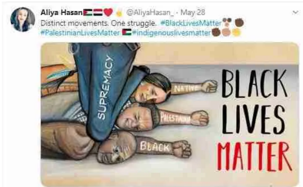
Canadian activist groups have also hopped onto the BLM gravy train by making non-existent links between African-American history, the plight of First Nations, and 'indigenous' Palestinian claims, all fighting "supremacy" as part of "one struggle."

UNRWA is literally profiting off of pain and conflict. And, here enters BLM and their new global agenda, which has nothing to do with Black lives. Someone at BLM decided that time was running out on their ability to profit off of Black pain. The more that parents and loved ones of those killed at the hands of police speak out against the BLM organization, the weaker their position as leaders in the movement becomes. So, on to the next.