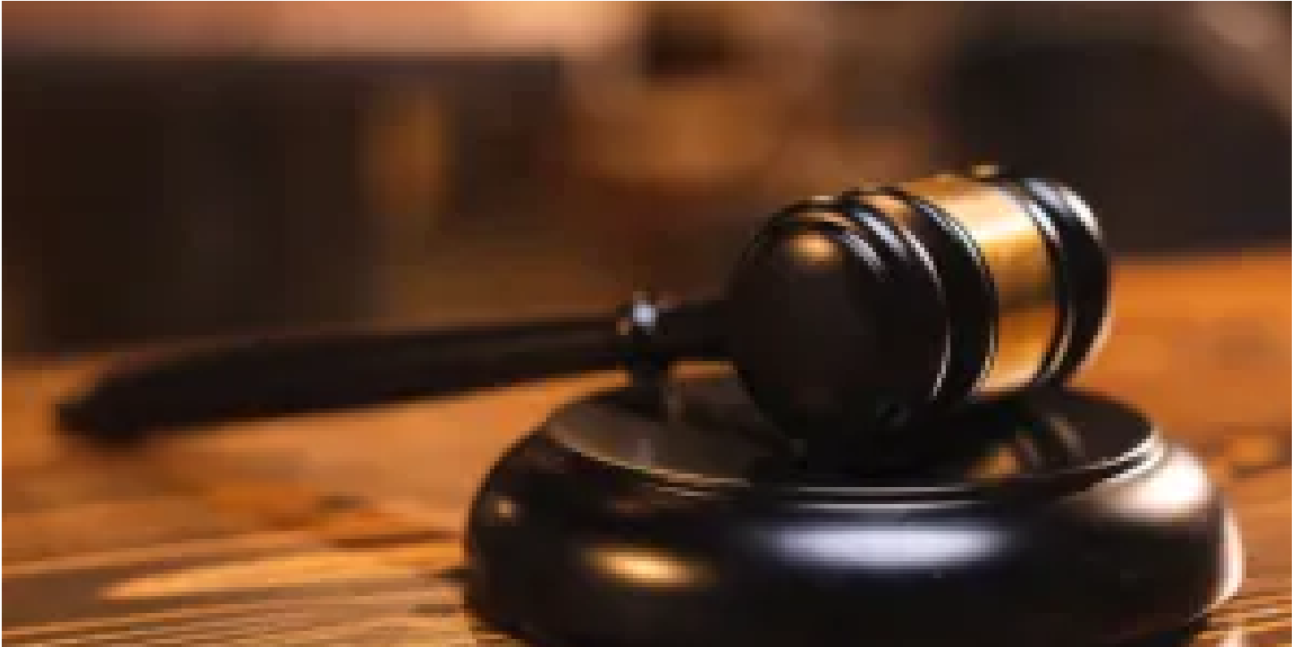
Four Questions About The Opponents Of Judicial Reform