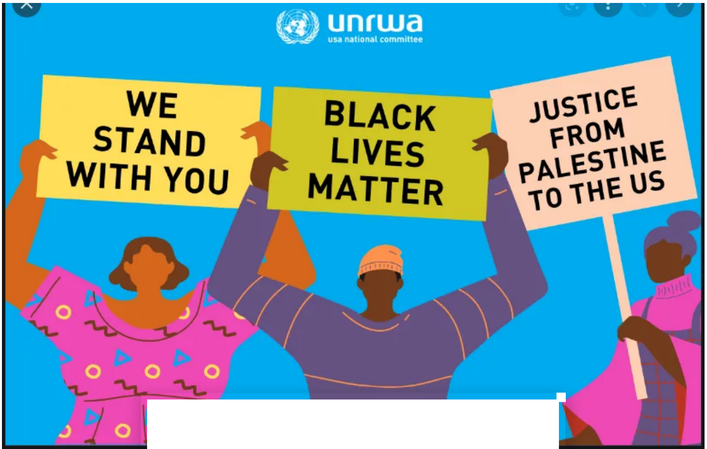
"Black Lives Matter is not just a hashtag" | action so that Black Lives Matter is not just a hashtag. We're starting by reading and discussing Dr. Kendi's "How To Be An Antiracist" as a staff."