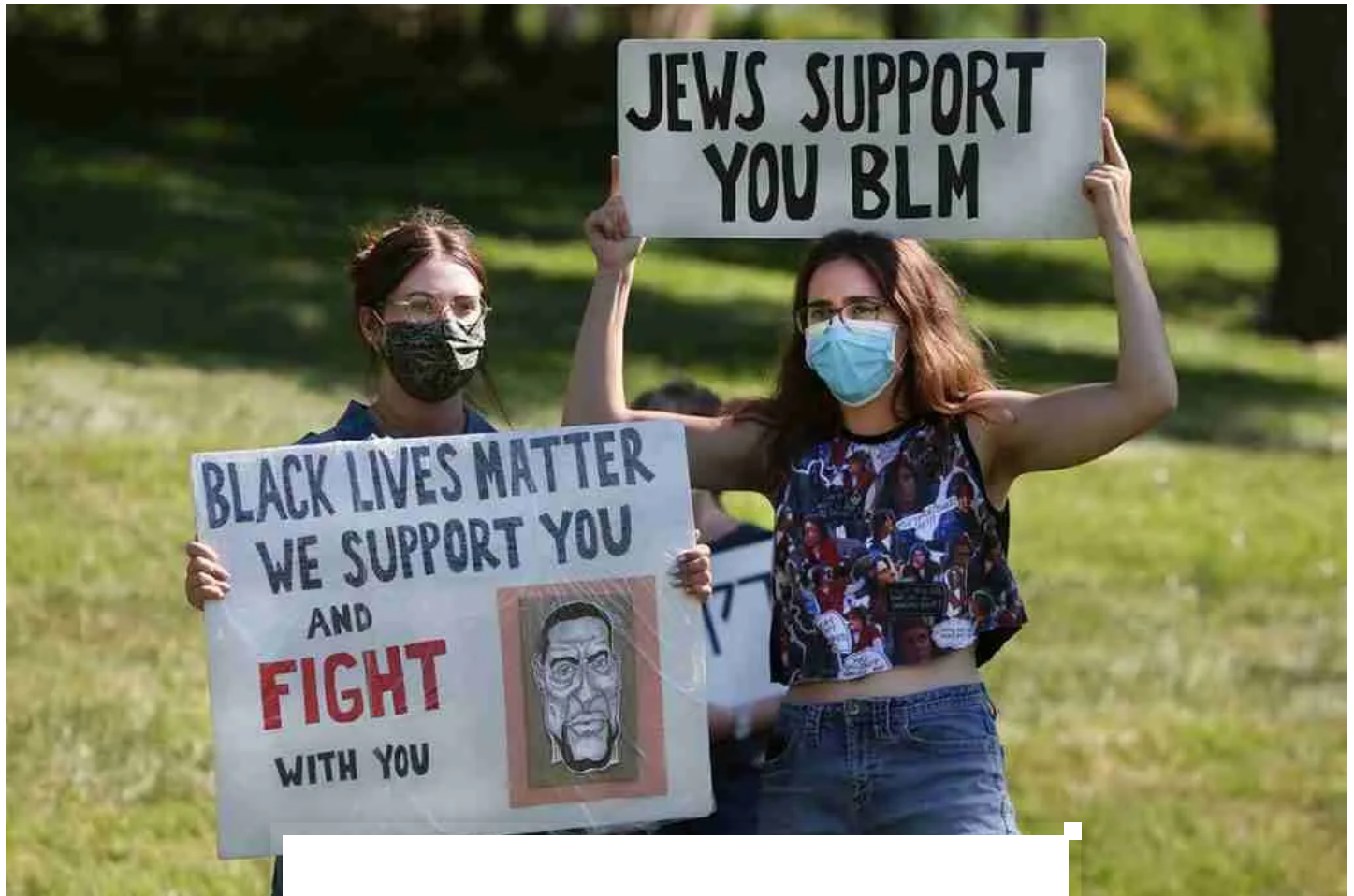
Jewish students at Xavier University show