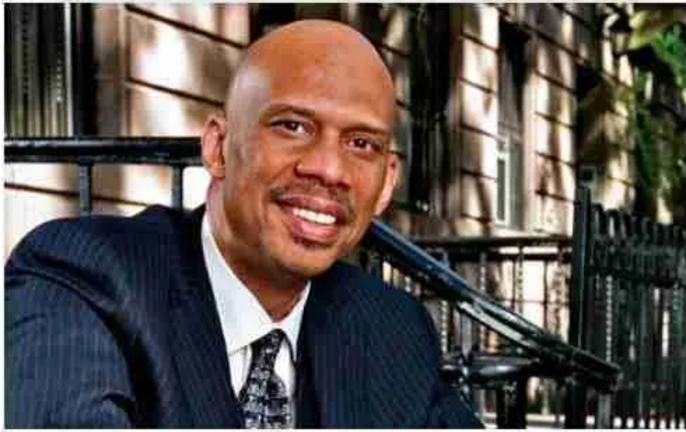
NBA legend and community leader Kareem Abdul-Jabbar says recent Antisemitism from celebrities "Troubling Omen" for the future of Black Lives Matter

The struggle of American Blacks to achieve their piece of that, frustrated despite the U.S. Constitution, The U.S. Civil War, and more recent civil rights legislation, has been bloody and discouraging.