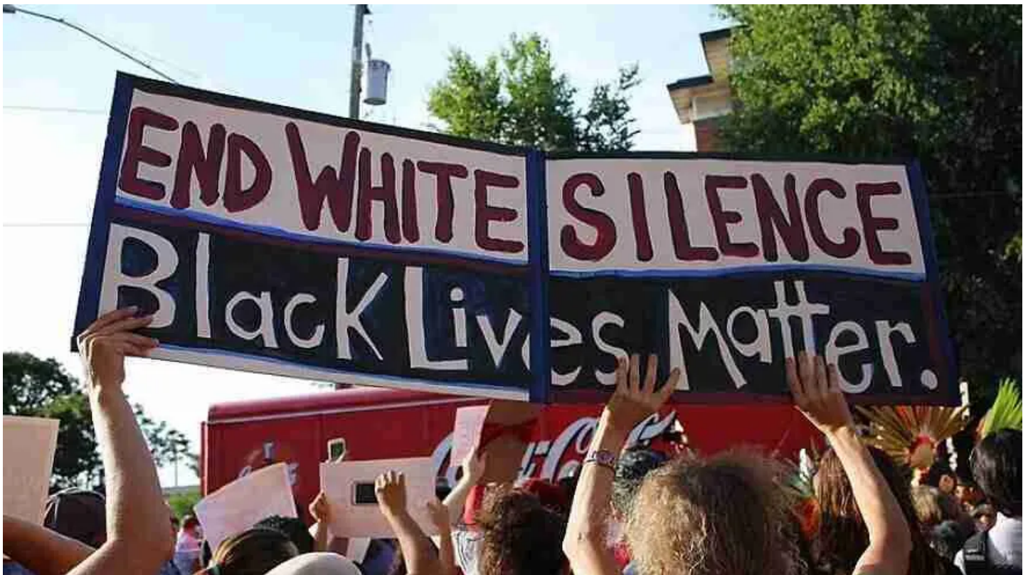
A Black Lives Matter protest in Minneapolis, Minnesota.