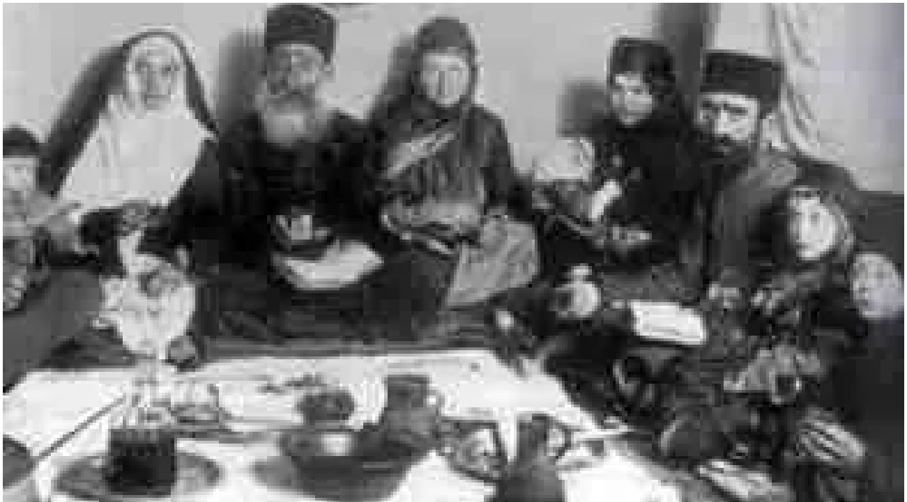
Passover In Soviet Times Compared To Today In Azerbaijan