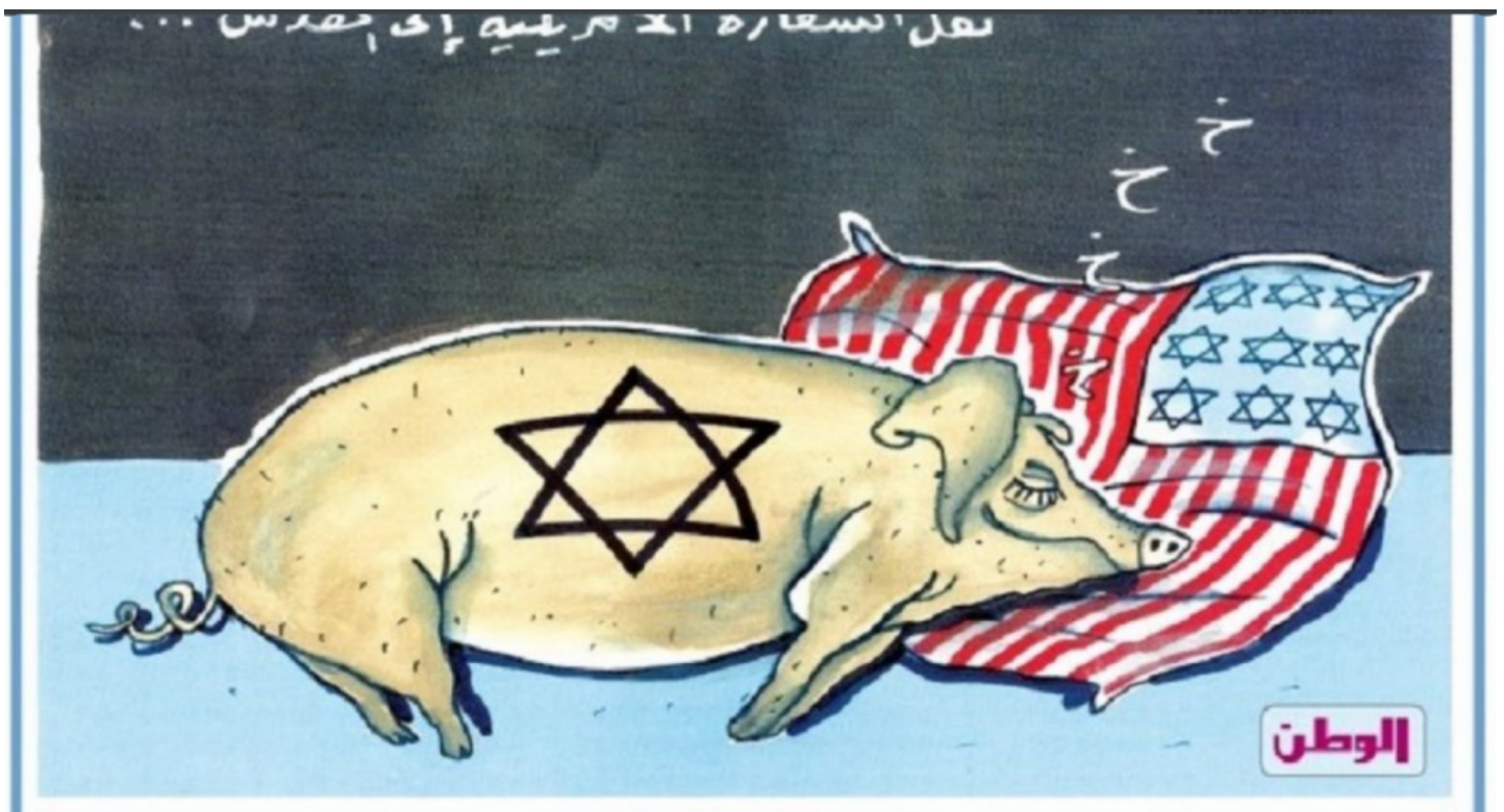
In the Arab world, utterly antisemitic and anti-Zionist cartoons depicting pigs are part and parcel of the campaign to destroy Israel-USA "imperialism".

03 June 2021 | 9:07 am By Gary S. Branfman