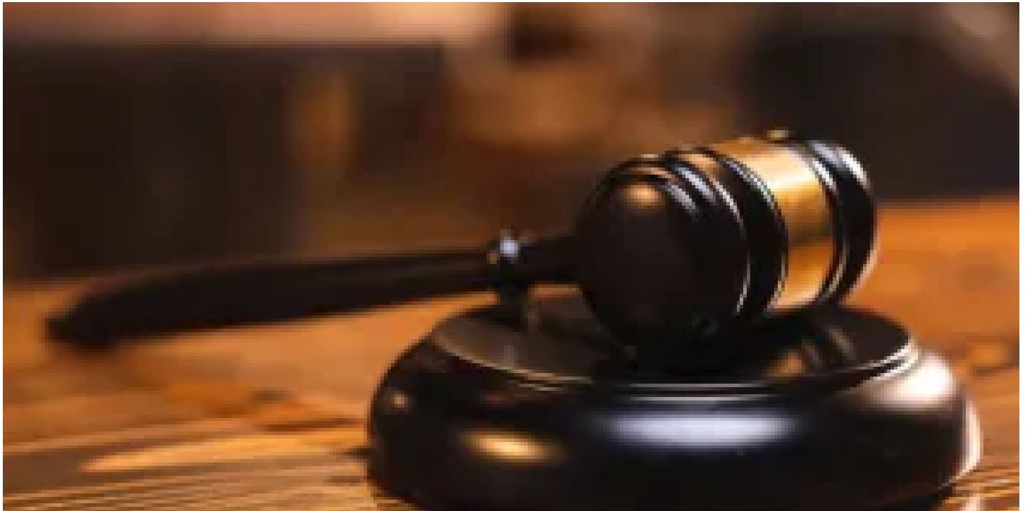
Four Questions About The Opponents Of Judicial Reform