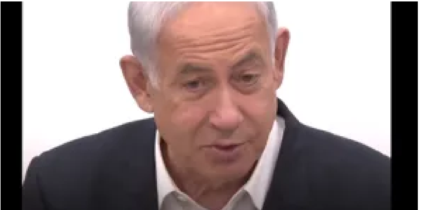
A 'Resistance' Coup Just Defeated Israeli Democracy