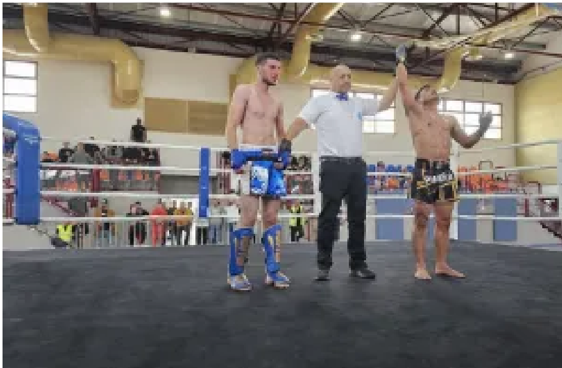
Israel's New Kickboxing Champion A Bnei Menashe Immigrant From India