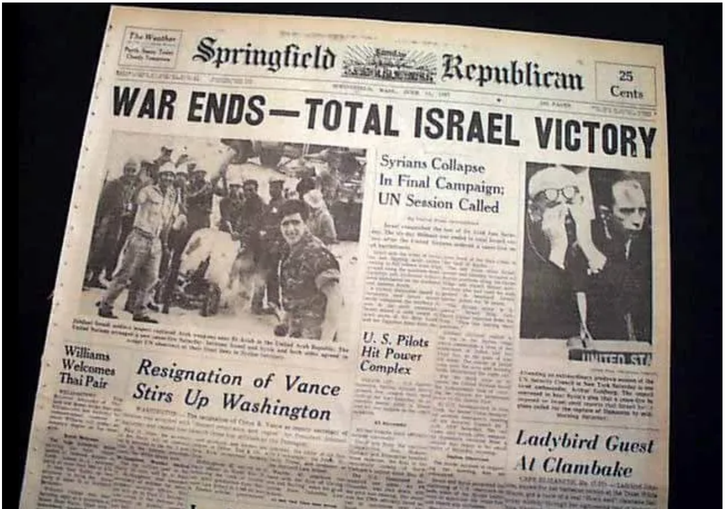
Not until Israel defeated and humiliated Arab countries in the Six-Day War (June 1967), ending Jordanian control over West Bank Arabs, did a distinctive Palestinian identity begin to emerge.