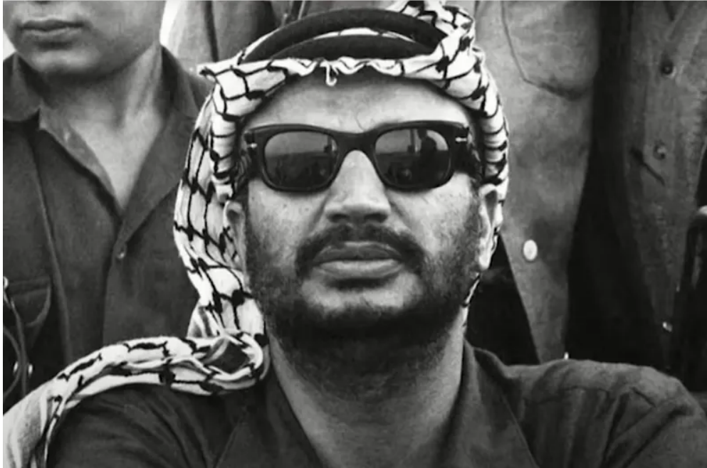
Yasser Arafat "was an Egyptian bourgeois turned into a devoted Marxist by KGB foreign intelligence," said Ion Mihai Pacepa in the Sept 24, 2003 edition of the Wall Street Journal. "First, the KGB destroyed the official records of Arafat's birth in Cairo, replacing them with fictitious documents saying that he had been born in Jerusalem and was therefore a Palestinian by birth... In March 1978 I secretly brought Arafat to Bucharest for final instructions on how to behave in Washington."

To achieve its objectives, the Kremlin devised Operation SIG, a disinformation campaign intended "to turn the whole Islamic world against Israel and the U.S."