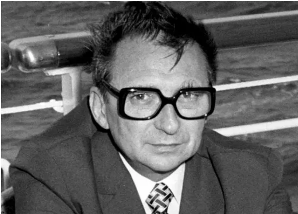
Gen. Ion Mihai Pacepa, the head of Romania's foreign intelligence service, photographed on Raul Castro's boat in Cuba, 1964. He told the Catholic News Agency that "the Palestine Liberation Organization (was) created by the KGB with help from Yasser Arafat... (was) born at the Lubyanka -- the headquarters of the KGB."

Yet despite these baleful facts, the West persists in its implacable belief that Israel is the problem.