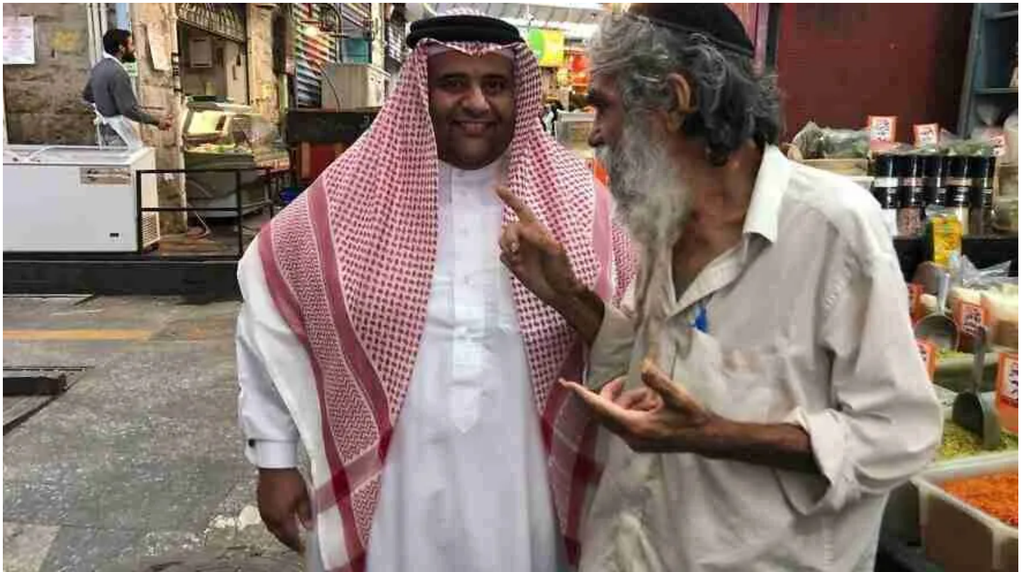
A Bahraini man chats with an Israeli at Jerusalem's Machane Yehuda outdoor market, October 2021.

20 January 2022 | 12:07 am By Melanie Phillips