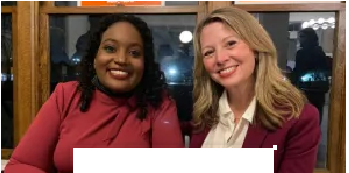
Headscarf ban apology accepted by headscarf community leaders